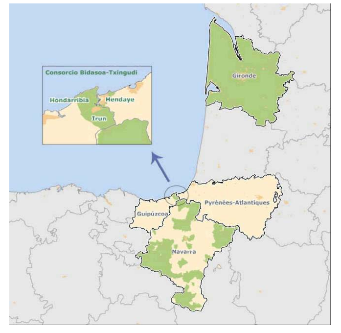
Figure 1: Regions participating

Regions: Navarra, Gironde, The Bidasoa-Txingudi Consortium and the Council of Hendaya. The public company Trabajos Catastrales S.A., also ranks among participants, as a technological partner.