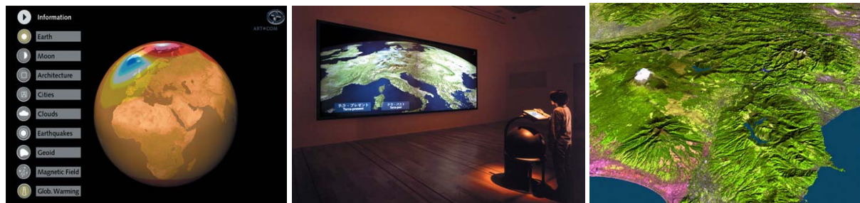
Figure 1-3: TerraVision ( http://www.artcom.de )

AL GORE (1998) said in his legendary speech on ‘The Digital Earth: Understanding our planet in the 21st Century’: “I believe we need (...) a multi-resolution, three-dimensional representation of the planet, into which we can embed vast quantities of geo-referenced data.” As early as in 1995, Art+Com anticipated somewhat of Al Gore’s foresight presenting TerraVision (MAYER et al. 1995, 1996). The figures show examples of TerraVision’s graphical user-interface (1), the tangible globe interface (2), and interactive terrain rendering (3). Long before of hardware-accelerated consumer graphics cards, and broadband Internet access, the world was not ready for this prototyp requiring a SGI graphics super computer. Meanwhile, the rapid development of hard- and software for interactive visualisation has been triggered by the fast growing market of computer games and paid by millions of enthusiastic computer game players.