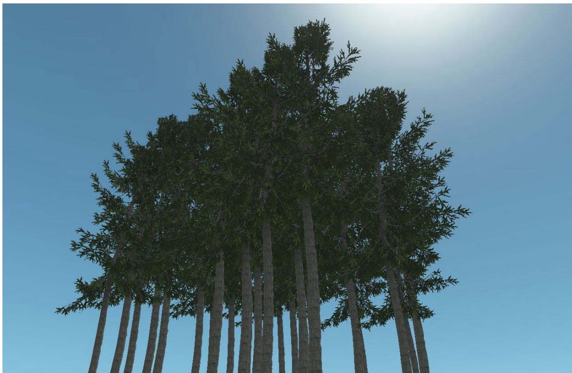
Figure 9: Forest stand visualisation calculated by the interactive thinning simulator JTragic (HAUHS et al. 2001; screenshot: Biosphere3D, Flora3D tree models, 2007)

One such application could be a forestry simulation tool where the forester can interactively decide which trees is to cut down while the forest develops over time. If Biosphere3D is used for visualisation, there are three interfaces to the application: First, the current forest has to be transferred to Biosphere3D. Second, the user should be able to select trees in the 3D view. Biosphere3D has to report which tree is visible for a given coordinate in the generated image. Third, the application should be able to modify the rendering settings of individual plants to allow highlighting of selected trees.