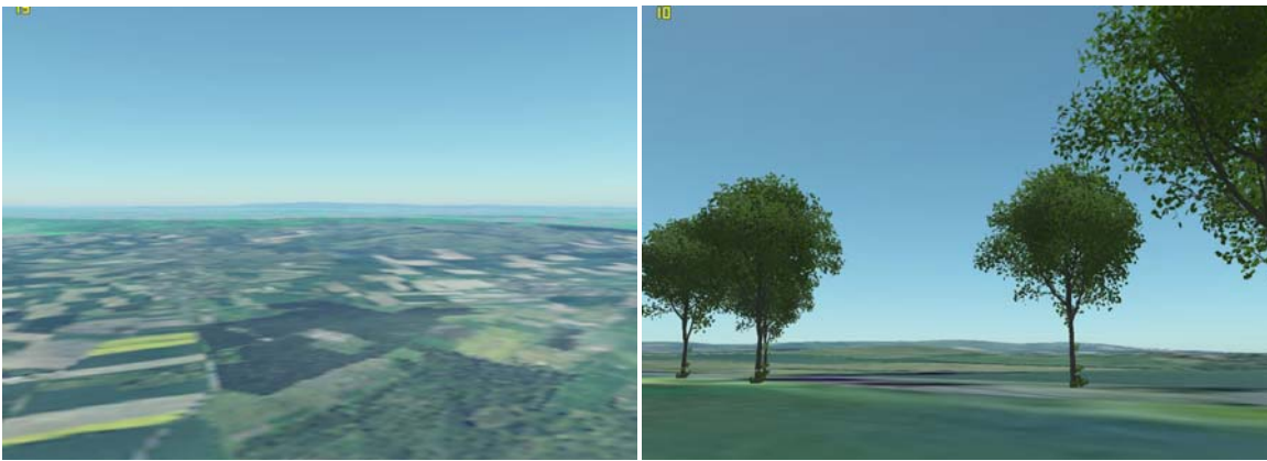
Figure 6+7: Landscape in Germany; at eye-level planting trees (screenshots: Biosphere3D, 2006; data: NASA SRTM and Blue-Marble, LGN orthophoto, Lenné3D Flora3D trees)