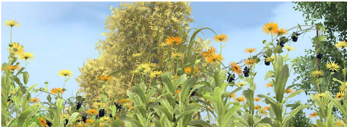
Figure 8: Pot Marigold ( Calendula officinalis ) in a garden

Habitat and land-use data provide the basis for Lenné3D's vegetation modelling; the input of further geographical data allows automatic generation of plant distribution maps (RÖHRICHT 2005). Three-dimensional plant models are assigned to the distribution map and positioned on the terrain model.