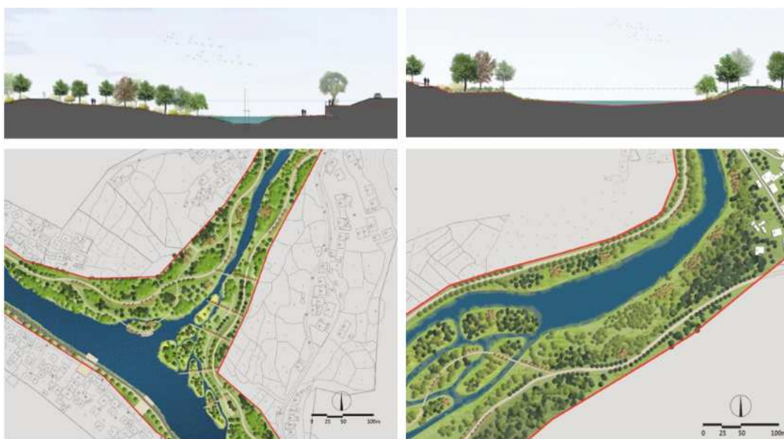
Design of green embankments, riparian landscape and rehabilitated wetlands with increased flow capacity and enhanced biodiversity.

Jilin Yanji Low-Carbon Climate-Resilient Healthy City Project Case: For this project, ADB used the design of sponge cities as a platform for mitigation and adaptation elements, such as public transport to promote walking and cycling and healthy lifestyles (ADB, 2019). It further piloted innovative approaches, including advanced computer modelling, demonstrating that integrating green and gray infrastructure can significantly reduce urban flooding (pluvial flooding).