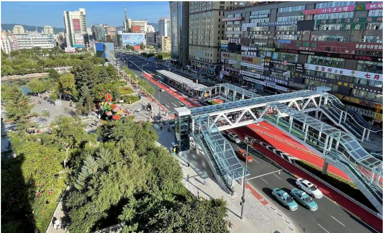
Implemented first phase of the bus-rapid transit with bike paths and sponge city tree planting and road median landscape linking to green parks.

Annual rainfall in Changzhi is low (534 millimeters), with more than 60% falling in summer. Groundwater resources are widely used. Changzhi is exposed to wildfire, drought, and seasonal flooding risks, all of which will be exacerbated by climate change. By 2050, the average temperatures in Changzhi are expected to increase by 2.3°C, which will likely cause a potential increase in evaporation. The changing climate will also increase extreme weather events, with long dry periods and heavy rainstorms, and increased water scarcity, droughts, and floods. Continued groundwater use has caused a significant depletion in the water table, which has dropped by more than 10 meters in some areas since 2000. In Qinyuan and Licheng counties, recent floods damaged riverbanks with over 300 households significantly affected. Changzhi's institutional capacity on climate-resilient planning and green financing are weak and fiscal resources are limited. Lack of cross-sector coordination within the government along with a lack of information and communication technology (ICT) platforms hinders the modernization of governance. Poor urban and transport planning have resulted in climate-vulnerable urban patterns.