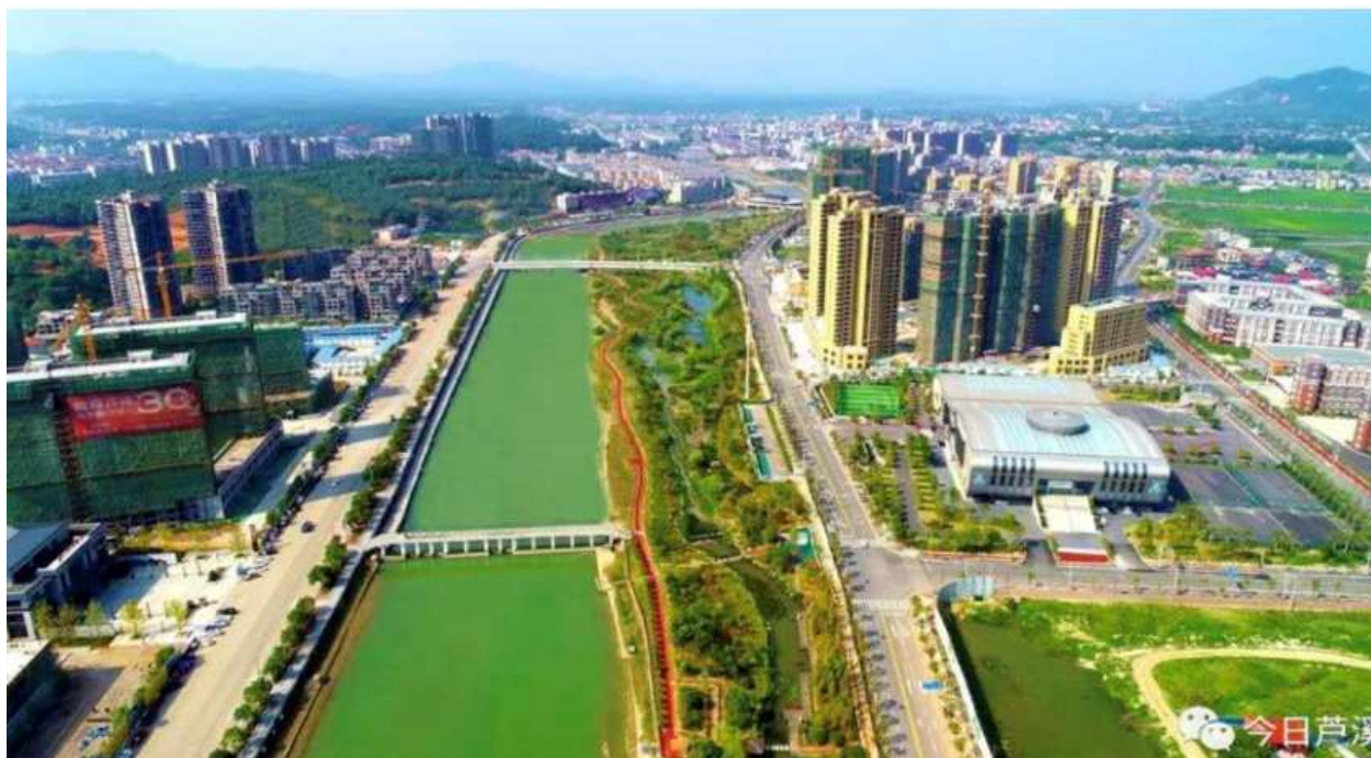
Aerial Foto of a completed wetland restoration that doubles as urban park for recreation and for improving microclimate in Pingxiang.

from increased tax revenue of increased property values and more people and businesses attracted to the greener towns.