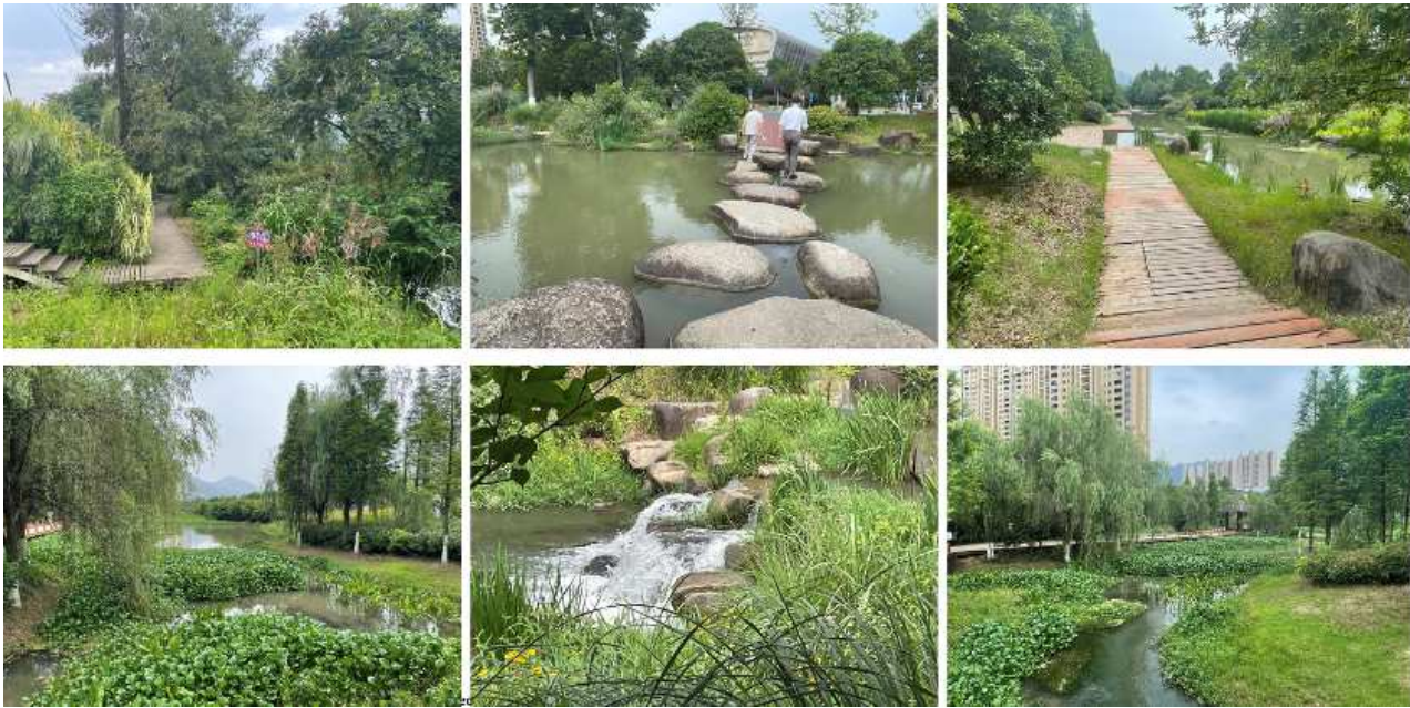
Flood risk reduction. Restored riverside wetlands and green water edges along gentle slopes along the river reduces the risk of flooding. At the same time, they provide a habitat for a diversity of plant and animal species and serve as an amenity for residents during non-flood times.

pluvial flooding during heavy summer rains. The Chaoyang River urban catchment area is currently exposed to flood risks of 1-in-20-year flood events.