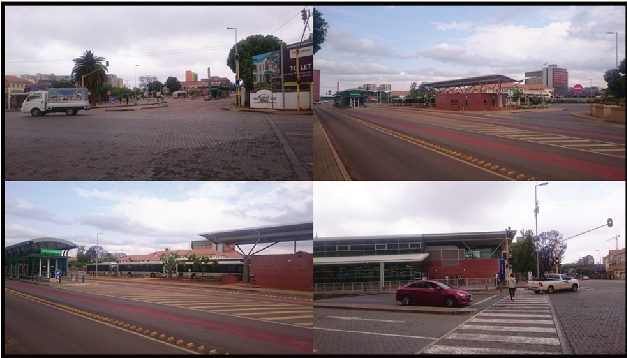
Figure 2: Spatial form around Gautrain and A Re Yeng stations in Hatfield