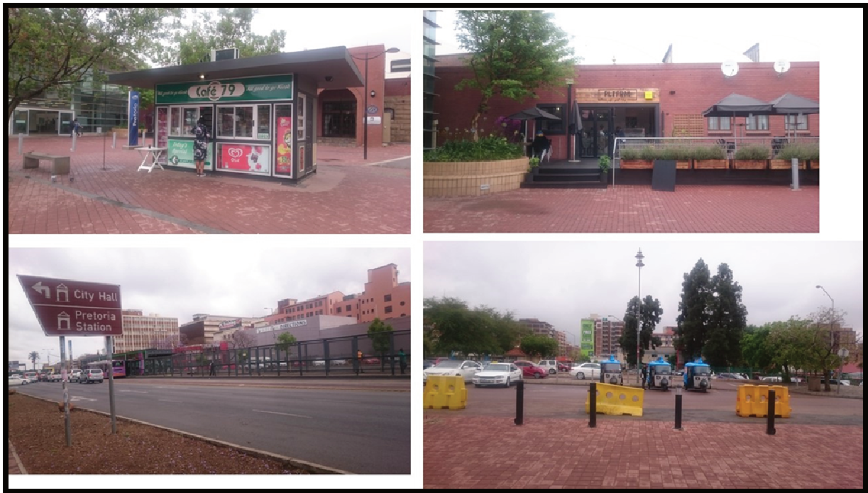
Figure 1: Spatial form around Gautrain and A Re Yeng stations in Pretoria central

The opportunity presented by the high concentration of various public transport related activities in one node cannot be over-emphasized. A variety of public transport modes concentrated in one location presents an opportunity for the creation of a mixed-zone activity node which accommodates small-scale entrepreneurs and established businesses, given different services they provide to commuters and people working or living in the area. The city should consider such initiatives in the form of a precinct plan linking Bosman station with the City Centre, where there is also the Church Square main station for the Tshwane Bus Service also near the A Re Yeng Station. Activities of small-scale entrepreneurs are evident, but with proper planning this can be transformed to a vibrant activity node for small businesses and social upliftment. The amount of space evidently available as seen in the bottom left corner picture, there is a potential to create more opportunities to accommodate small-scale entrepreneurs (including informal traders) without negatively affecting the aesthetic value of the station precinct. Furthermore, a need for skills development to enable previously disadvantaged people to take full advantage of opportunities created was identified.