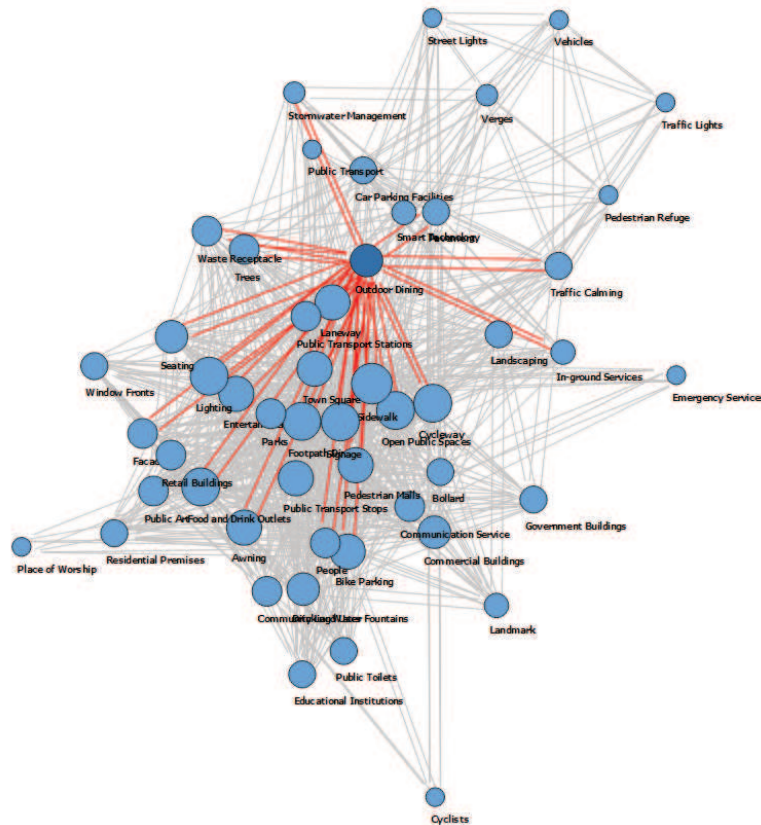
Fig. 3: SNA detailing the proximity relationships between main street physical objects

Some physical objects have more proximity relationships than other others and these are represented in Fig. 3 as a larger node. Generally, physical objects with more ties will be placed in a more central position on the graph from the Fruchterman & Reingold (1991) drawing algorithm. Following the larger physical object nodes, the SNA shows the town square, sidewalk, laneway, footpath, signage, lighting, entertainment precinct, food and drink outlets, open public spaces and cycleway all require many physical objects in proximity or conversely are providing for many other physical objects. For example, a town square provides the area for many physical objects to be within or a town square requires many physical objects to be an ideal main street town square. Similarly, how lighting is needed to be in proximity to many other physical objects like outdoor dining.