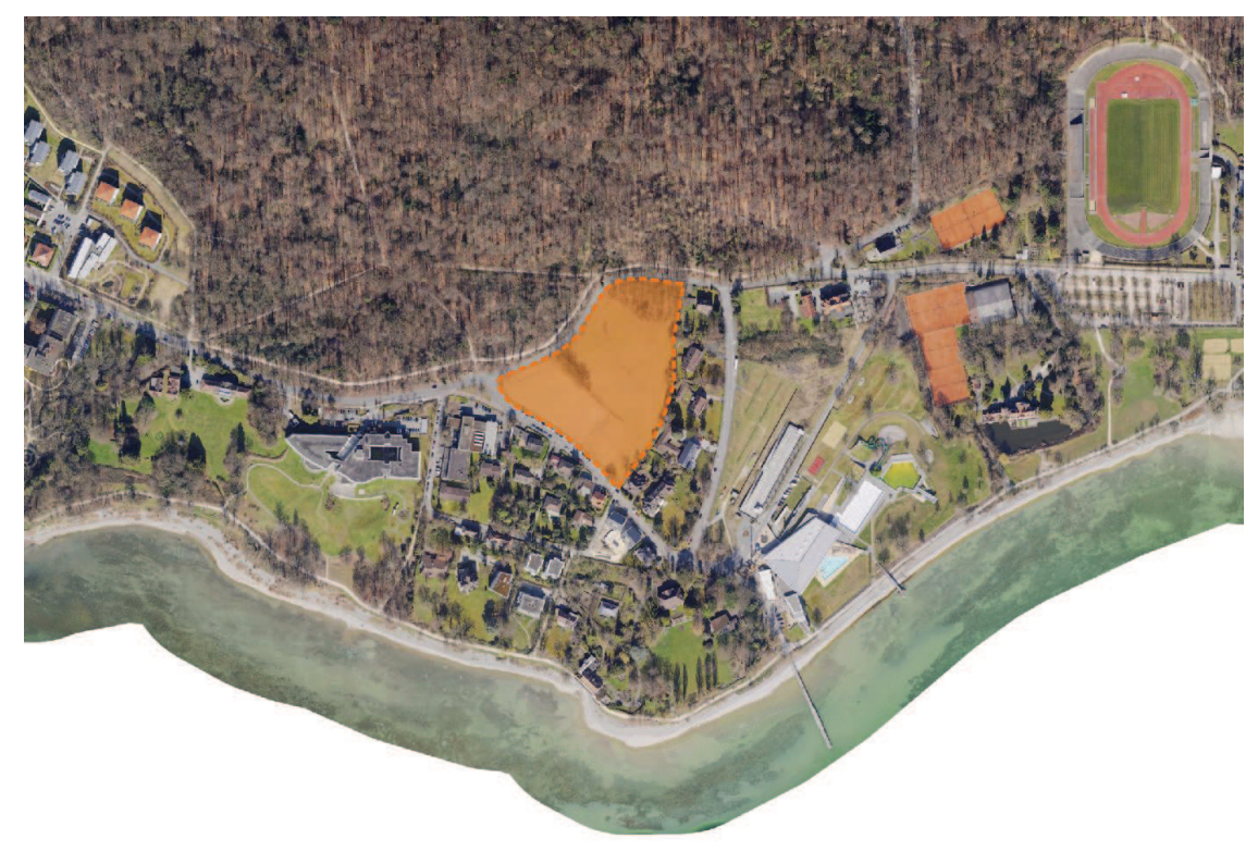
Fig. 2: Model district – Christiani-Wiesen.<sup>2</sup>

The goal of phase two is establish "Christiani-Wiesen" - a site with the size of 2 hectare - as model of sustainable urban planning. The designated area is part of the Action Programme Housing and is as such well-suited to work as urban living lab due to its size and planning conditions. Thus, the rather small site (see Figure 2) could become an initiator for future urban development of greater scope, e.g. in the area "Nördlich Hafner" that is home to 2.500 residential units.