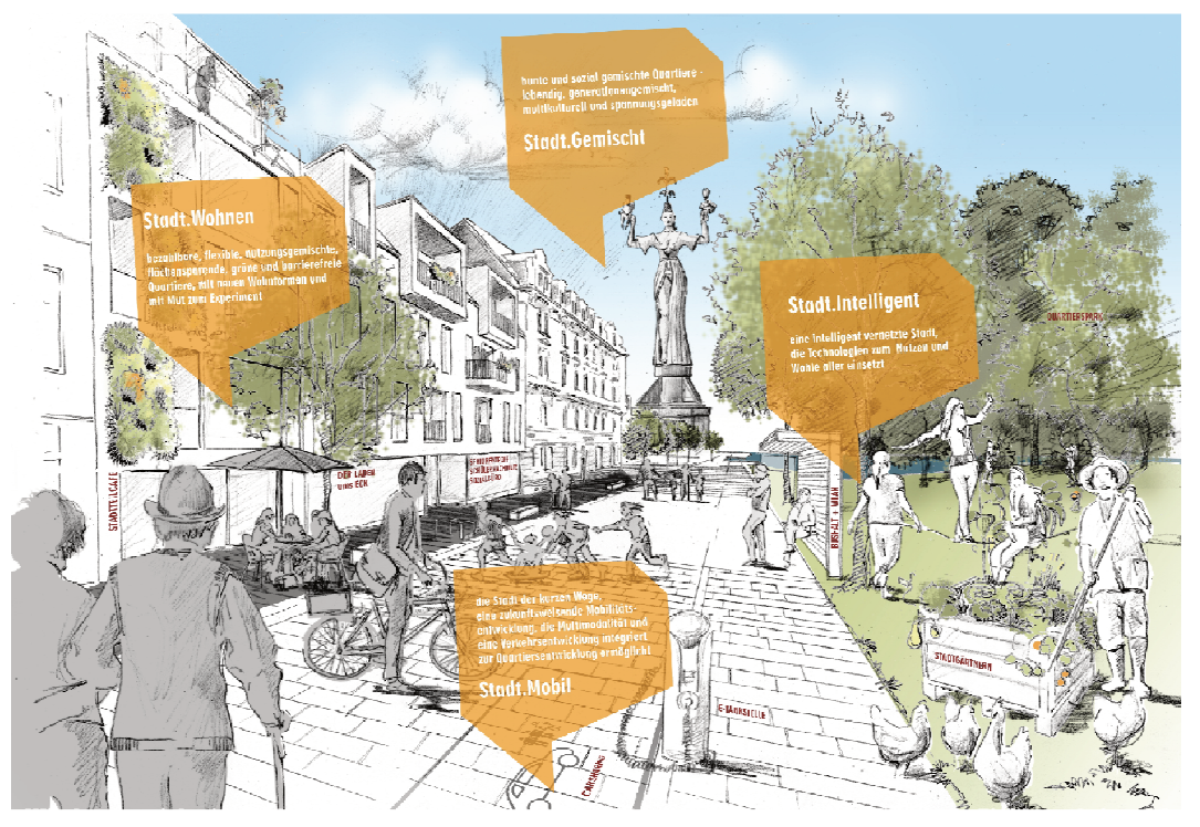
Fig. 1: Hidden object scene - Vision 2030+ City of Constance.<sup>1</sup>

In the first phase of the project, which ran from June 2015 to May 2016, various events were held to discuss the topics of the city of the future.