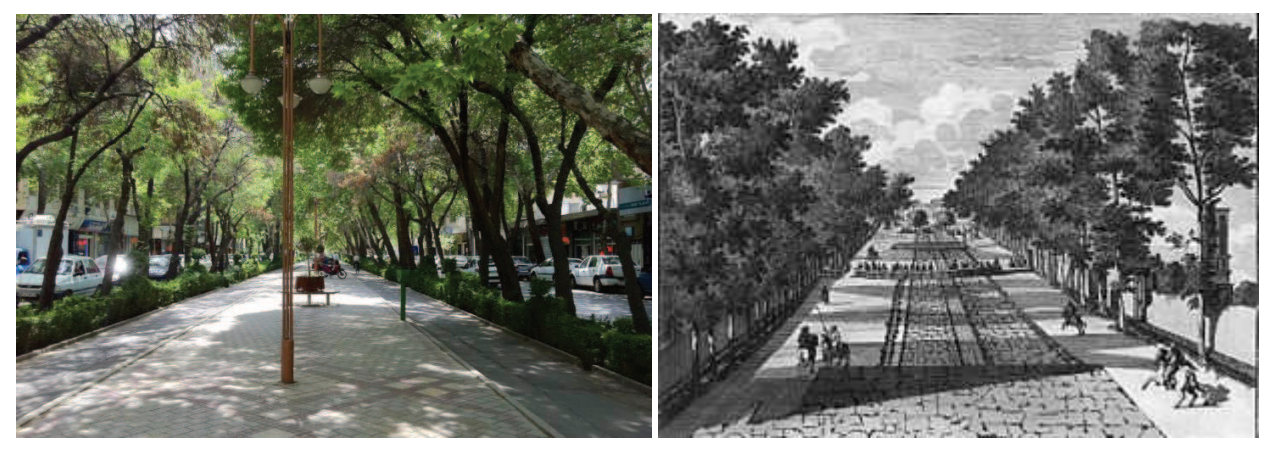
Fig. 3: Chaharbagh, now and safavid period.

In such condition which the axis has been formed during the ten centuries of Iran's urbanism history after the Islamic era and before the Safavid era, formation of straight urban axes have become important and valuable as much as the market in addition to the creation of urban open space in the role of recreational and tourism walkway. It can be said that the urbanization of Isfahan in the Safavid era presents two types of specific urban axeswith a completely different structure to the urbanism in the world. The first type is an organic and covered axis of markets which is the dominant element in providing the city's economy and since it spatially connects the squares, mosques, caravanserai, etc. to each other, it is considered as one of the most powerful public spaces.Such a structure with the scale of Isfahan market design can rarely be found as a continuous urban axis in the urbanism history of other territories. The second type is the green and straight tourism axis in a given scale. In addition to playing a role in providing urban green space, it is considered as urban public space by placing a specific architectural element around it and linking it to other important urban spaces (Ranjbar et al., 85).