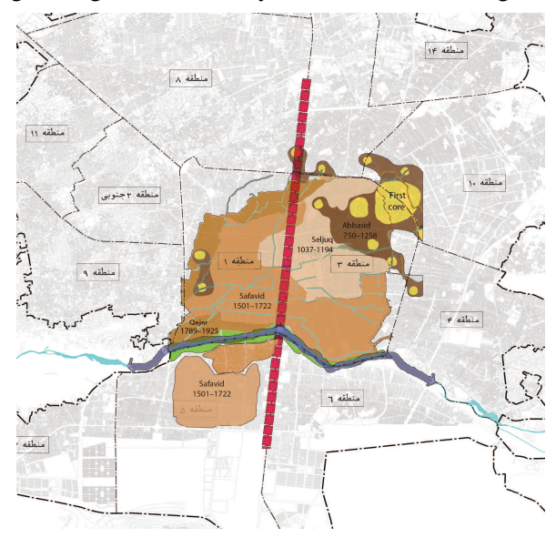
Fig. 1: Different periods of Isfahan

Designing a new and vast urban street called ChaharBagh, and creating a broad square with a clear definition of spatial arrangement as the new center of the city and not as a new city, makes it possible to use the concept of urban zoning in organizing the Iranian city for the first time; (Fig 2)