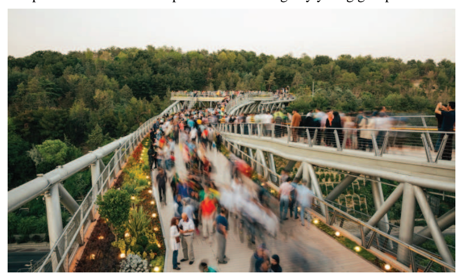
Fig. 5: Tabiat Pedestrian Bridge

of Tehran, have lead to introduce Abbasabad area as a tourisitic destination for pedestrians. Good connection to Metro and public transport by a network of walkable spaces and sidewalks at the heart of Tehran, introduce an excellent public spaces planning policy of Tehran Municipality. Connectivity is a key quality in the area. This is the main factor of Tabiat Bridge success as a new type of public spaces in Tehran which also has captured virtual spaces because of selfie photos on the bridge by young groups.