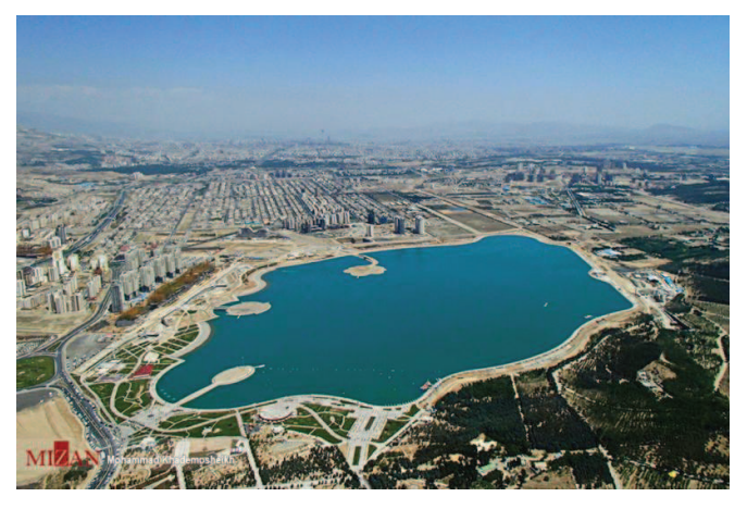
Fig. 4: Chitgar Lake

Based on deep observations, locating close to mountain in connection to forest, the artificial lale of Chitgar has provided unique waterfront for Tehran citizens, which is quite new change in history of 230 years old capital of Tehran. In spite of opening different restaurants in various styles some people use the area as a picnic place because of natural elements. This is a type Iranian usage of public spaces which gather people around a tablecloth. Around 9 kilometer continuous pedestrian including a ring of bicycle track bring pedestrians at the heart of public spaces. Although inner spaces are well equipped for pedestrian but accessibility to the waterfront from other part of the city is not so easy because of lack public transport. Planning different shopping malls like Iran Mall (one of the largest business centers in the Middle East with 1,200,000 m2 constructed area) has affected on the mobility of the area. So a paradoxical planning of mobility can be felt in the area.