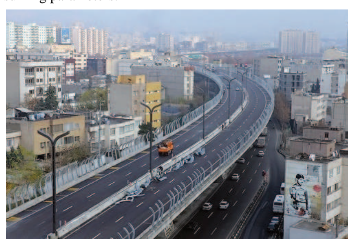
Fig. 7: Sadr Elevated Highway

are raise up when we look at Sadr's Elevated highway. A lot of money has been spent on project<sup>4</sup> that it was better to use such resource for developing public transport. Ranjbar & Mashhadi Moghadam (2017) research "Upgrading urban highways: issues and negative impacts based on a case study of Sadr's Elevated highway" results showe the highway has significant negative impacts in ecological dimension, including air and noise pollution and energy-consuming parameters.