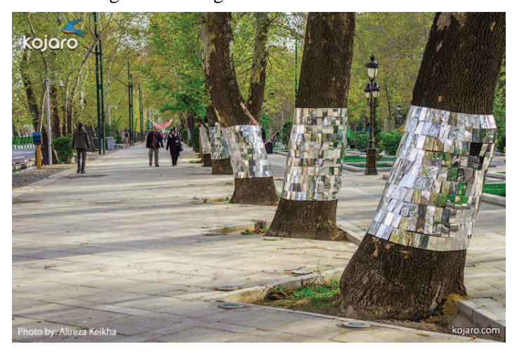
Fig. 6: Valiasr Street

Analysis of sidewalks in two main streets of Tehran, shows improving overall quality of walking. The challenges reveals when we concentrate on the details of paving, urban furnitures, the interaction of paving to old trees and facilities for disabled people. Because of paying less attention to protection and irrigation of trees which are a part of identity of these streets, we can see a failure in this way because of renovating sildwalks projects. The big challenge relates to mobility of disabled people in the project which is quite hard for them to use these sidewalks especially at intersection. Two years ago the intersection of these two streets has been a critical project in Tehran in which the pedestrian mobilaity has transferred underground. The dominancy has been gained by cars. In spite of developing sildewalks in these two streets, the intersection project is a sign to show urban manager main toughts.