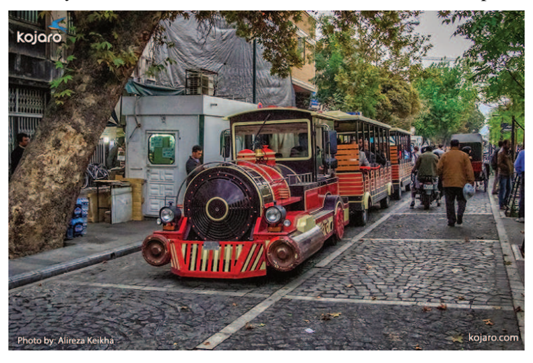
Fig. 3: Panzdah-e-Khordad pedestrian street

of the area. Accessibility to two metro station has effected on the richness of pedestrian mobility. Also providing public transport in the area has been helped to those who are not able to walk a lot. According to Samavati & Ranjbar (2017) reaserch "The Effect of Physical Stimuli on Citizens' Happiness in Urban Environments: The Case of the Pedestrian Area of the Historical Part of Tehran", pedestrianization of the area has been effective in overall happiness. Results of quesstionnair show overall satisfaction of people of changing mobility in the area. Also shopkeepers are more satisfied from economic point of view after changin streets from car dominant to pedestrian friendly situation. The main quality of the area which is more notable for people is safety especially for women (in day time not night time). Also decreasing the level of noise pollution is a key characteristic of the area which is rare in Tehran public spaces.