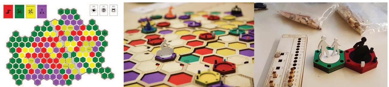
Figure 2: Game board (left), different mobility initiatives (middle), counting board and tokens (right)

The game board is divided in differently coloured tiles that represent the main tiers of these policies (purple for 'innovation and learning', green for 'active and healthy', yellow for 'flexible and connected', red for 'fair and safe'). Players move their playing figure on the game board by rolling a dice and start or join mobility initiatives, develop new services and implement different projects. In doing so, they collect coins (financial aspect), community points (social aspect) and CO 2 -reduction-points (environmental aspect).