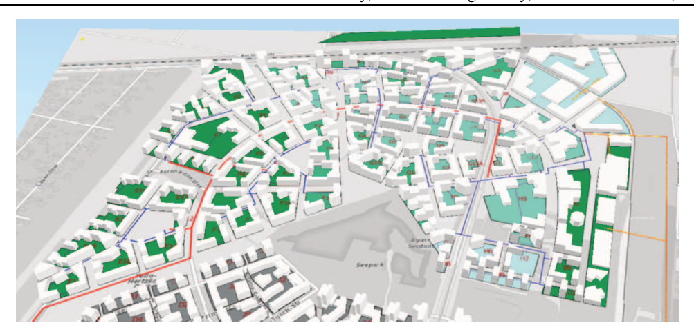
Fig. 2: Exemplary Building Construction of Aspern Nord (including pipes of district heating and gas supply), Source: AIT in Transform+ Deliverable 3.4 – Implementation Plan aspern Seestadt, December 2015

In terms of the conception of the heat supply, a business as usual scenario and three different options for Smart City scenarios were compiled.