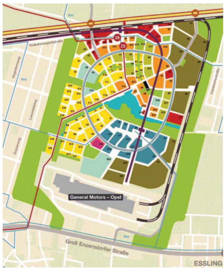
Fig. 1: Area map aspern - Donaustadt, Source: aspern+ citylab (2010): Vision + Wirklichkeit. Die Instrumente des Städtebaus. Ein citylab-Report von aspern Die Seestadt Wiens.

Housing uses are foreseen mostly in the south- and north-eastern part of aspern Seestadt (yellow), with a projected development of 4,600 residential units south of the lake and 7,500 residential units in the northern part of the lake. Since October 2013, aspern Seestadt is connected by subway to the public transport network. Two subway stations - one in the North and one in the centre of aspern Seestadt - are connecting the new city district to the rest of Vienna. The extension of the subway line U2 prior to the settling in of the first residents was conceived as an engine of urban development and stimulate the use of public transport.