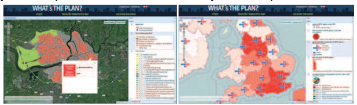
Fig. 5 Thematic Map Viewer [15] [17]

Part of this information is publicly available on the portal whatstheplan.eu, developed in project Plan4business through a specific API, Map Viewer and Location evaluator. Thematic viewer support visualization of different thematic maps related to spatial planning, geography, environment and economy of regions. These maps are available also for mobile clients (see Fig. 5 Thematic Map Viewer) [15] [17]