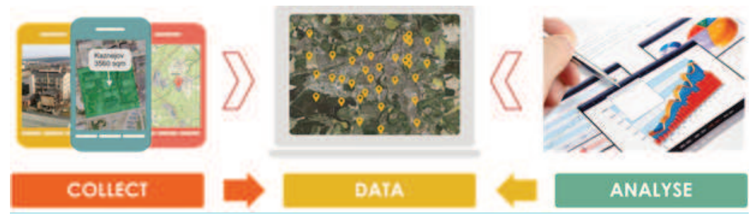
Fig. 4 Basic scheme of Brownfields4LIFE [15]

The broker will provide services for automated data harvesting from various sources, data collection using mobile phones and mechanisms for data analysis and access through APIs and other machine to machine interfaces (See.Fig. 4 Basic scheme of Brownfields4LIFE). [15]