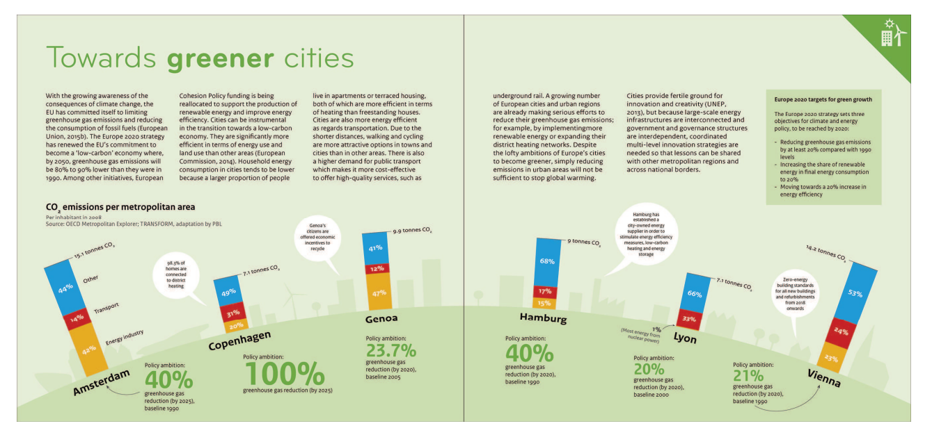
Fig. 3: Infographic on CO2 emissions and policy ambitions in six European metropolitan areas