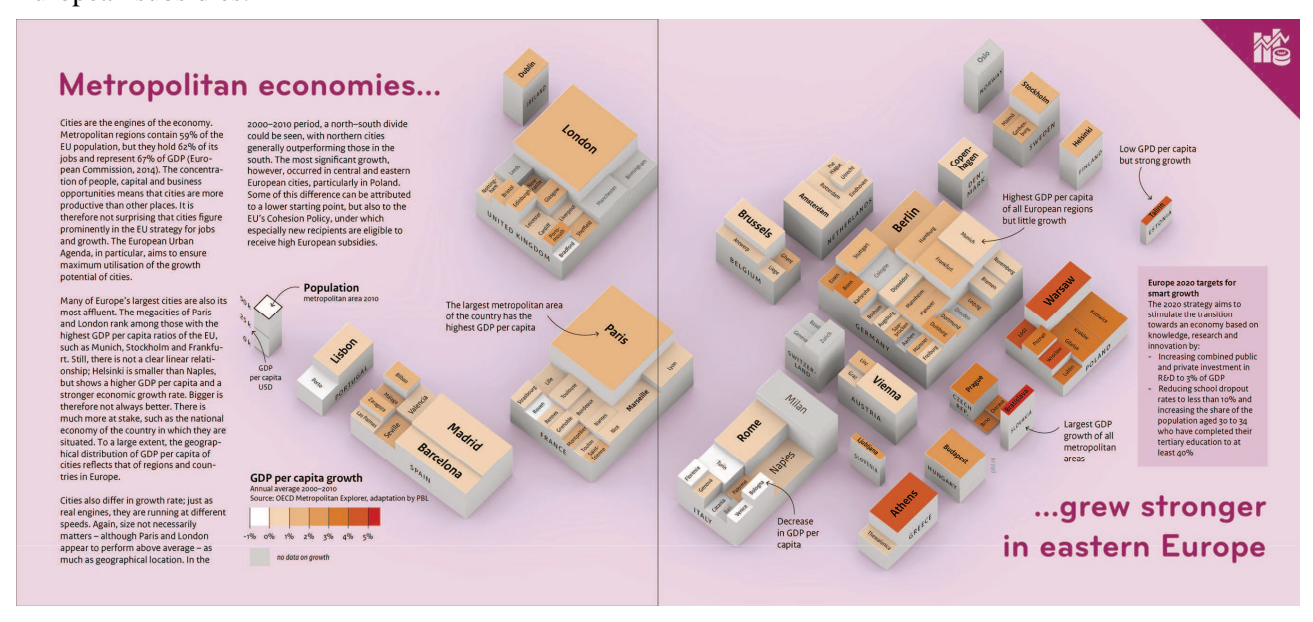
Fig. 2: Infographic on GDP per capita growth in European metropolitan areas (source: OECD, adaptation by PBL)

Cities also differ in growth rate; just as real engines, they are running at different speeds. Again, size not necessarily matters – although Paris and London appear to perform above average – as much as geographical location. In the 2000–2010 period, a north–south divide could be seen, with northern cities generally outperforming those in the south. The most significant growth, however, occurred in central and eastern European cities, particularly in Poland. Some of this difference can be attributed to a lower starting point, but also to the EU's Cohesion Policy, under which especially new recipients are eligible to receive high European subsidies.