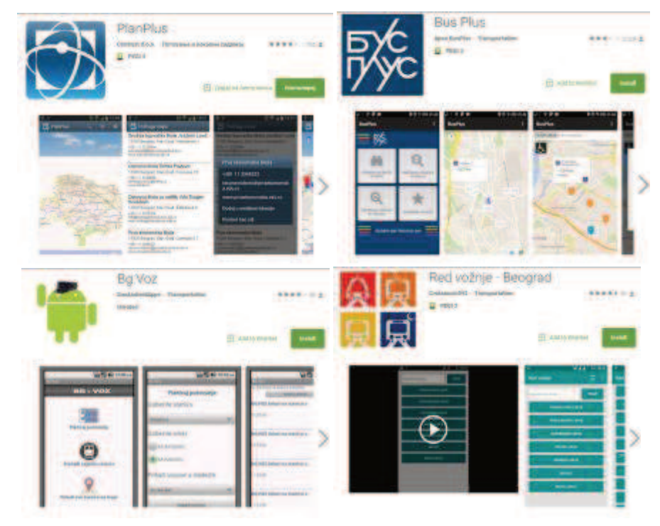
Fig. 3: Applications dealing with public transportation, time-table and preferred connections.