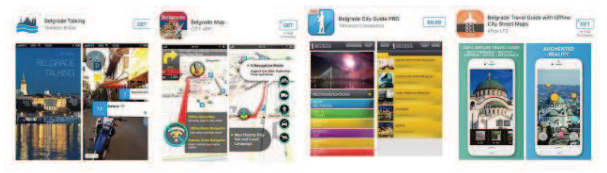
Fig. 2: Applications 'Belgrade Talking', 'Belgrade Map', 'Belgrade City Guide', 'Belgrade Travel Guide' - providing a better experience and movement in the city.

There are also several web-sites and mobile application more specialized and focused on urban mobility. 'Belgrade Plan Plus' represents the official and most used internet site for wayfinding in Belgrade. It offers a digital map with streets, connections and important places. 'Bus Plus', the internet site and mobile application is used as a payment tool for the public transport in Belgrade in the form of a smart ticket system in which consumer can upload money for transport fees, depending on the type of card (personalized, paper and electronic card). Simultaneously, there are several apps and sites concerning the public transportation in Belgrade and its timetable. For example, 'BG voz' is the internet site and mobile application about Belgrade train system. It offers information about arrivals, departures, nearest stations, or the progress of expected train. 'Red voznje - Beograd' has a similar content, but it covers all types of transportation.