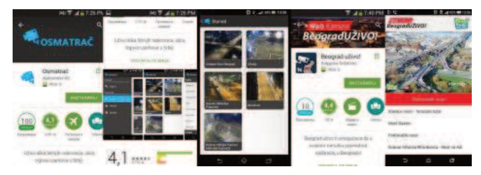
Fig. 1: Applications 'Observer' and 'Belgrade Live', a possible base for the future smart urban performances: the use of real-time data as a tool for improving the environmental quality and efficiency of urban services.

There are also several web-sites and mobile application more specialized and focused on urban mobility. 'Belgrade Plan Plus' represents the official and most used internet site for wayfinding in Belgrade. It offers a digital map with streets, connections and important places. 'Bus Plus', the internet site and mobile application is used as a payment tool for the public transport in Belgrade in the form of a smart ticket system in which consumer can upload money for transport fees, depending on the type of card (personalized, paper and electronic card). Simultaneously, there are several apps and sites concerning the public transportation in Belgrade and its timetable. For example, 'BG voz' is the internet site and mobile application about Belgrade train system. It offers information about arrivals, departures, nearest stations, or the progress of expected train. 'Red voznje - Beograd' has a similar content, but it covers all types of transportation.