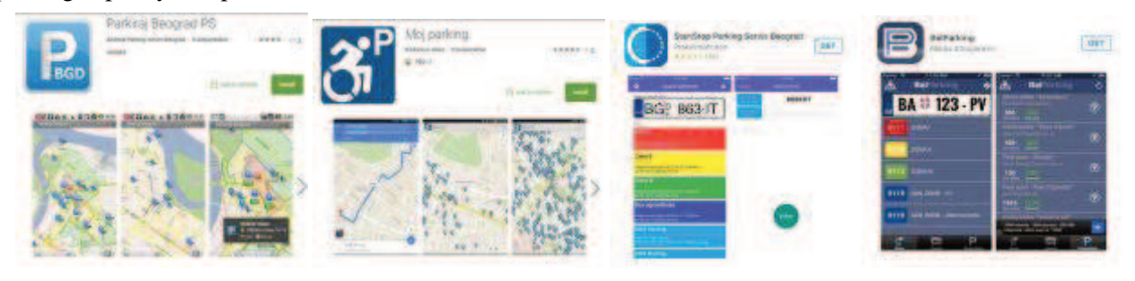
Fig. 4: Applications focused on the problem of parking - capacity, availability, routes and prices.

Several apps in Belgrade offer information about parking places, zones, and capacity in different areas of the city (e.g. 'StartStop Parking Servis Beograd', 'BelParking', 'Parkiraj Beograd PS' and 'Moj Parking'). The application 'Moj Parking' (My parking) is especially interesting because it also provides information on parking capacity and places for disabled.