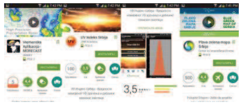
Fig. 6: The applications focused on weather data and natural resources - 'MORECAST', 'UV indeks Srbija', 'Blue Green Map of Serbia'.

Apart from these interfaces which have to be further developed in order to include more environmental features, the Center for environemental improvement has developed several applications (e.g. 'MORECAST', 'UV indeks Srbija', 'Blue Green Map of Serbia') which include information about weather, precipitation, UV radiation, the ozone layer or natural resources. They provide another kind of information which could be used both by citizens and tourists, raising environmental awareness and stimulating trend of biophilia.