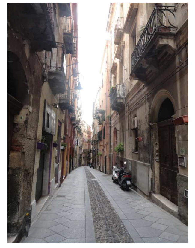
Fig. 2: View of a typical alley in the historic centre of Cagliari.

The DCM-based analysis is implemented through a questionnaire delivered to the residents of the Cagliari's historic center's neighborhoods (Comune di Cagliari, 2011). Through their participation in the experiment, resident families' representatives should increase their awareness of the most important issues related to the spatial organization of their urban living areas, and provide information on correlations between perceived urban quality and the three types of determinants mentioned above.