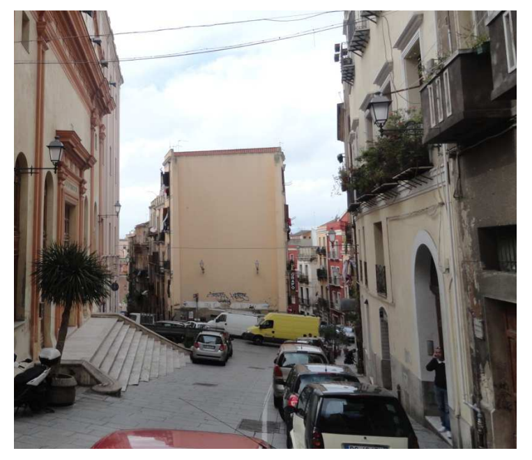
Fig. 3: Lack of car parks in the neighborhood Marina.

The issues, which enter as explanatory variables in the model we estimate in our analysis, should be addressed and managed through the urban planning policies defined by the political and administrative authorities of the local municipalities.