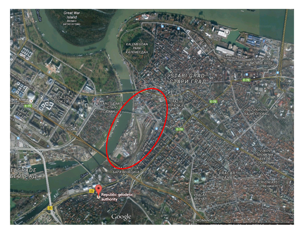
Figure 1. Site location of the project "Belgrade Waterfront"

competition for projects of such magnitude. Although this statement was later retracted, the contradiction was never fully cleared up. In addition, the role of the state in the project remained vague, in particular in terms of its financial commitments in constructing infrastructure at the site before construction could begin in earnest.