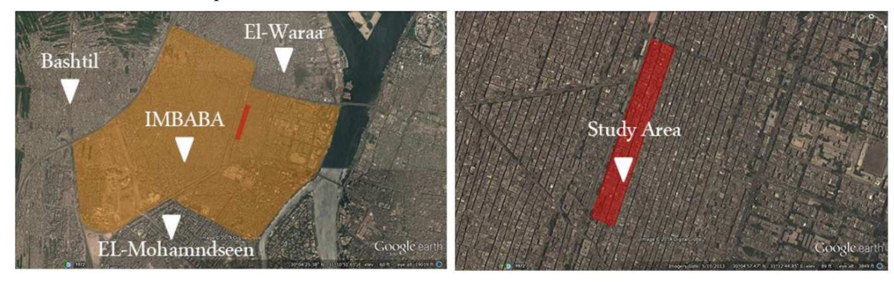
Figure 2Imbaba district and the study area, Cairo

The study area as shown in Figure 2 is a typical mixed use area. It has both retail and residential uses along with some workshops. The prevailing building height is 4 storey high and the buildings are attached on 3 sides leaving only one façade free. The area is one of the oldest in the district with some buildings dating from the 1960s, which implies the consolidation state of both the built and the social environment.