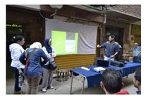
Figure 3 workshop and presentation on the street to engage local residents and youth, authors

In order to complete the water flow study, the students along with the CBOs have investigated water quality and flow from upstream, the potable water facility with its intake from the Nile, and the downstream where wastewater goes through the water treatment facility and, in most cases, back to the Nile. Acomplete Sankey diagram was developed based on the complete information collected. After finishing the data analysis, another workshop and presentation was conducted on the street to demonstrate the study findings to local residents and ensure project transparency.