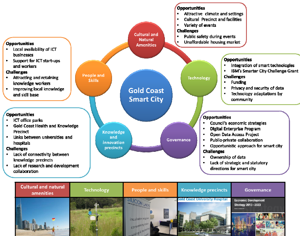
Fig 3: Challenges and opportunities to develop Gold Coast as a smart city