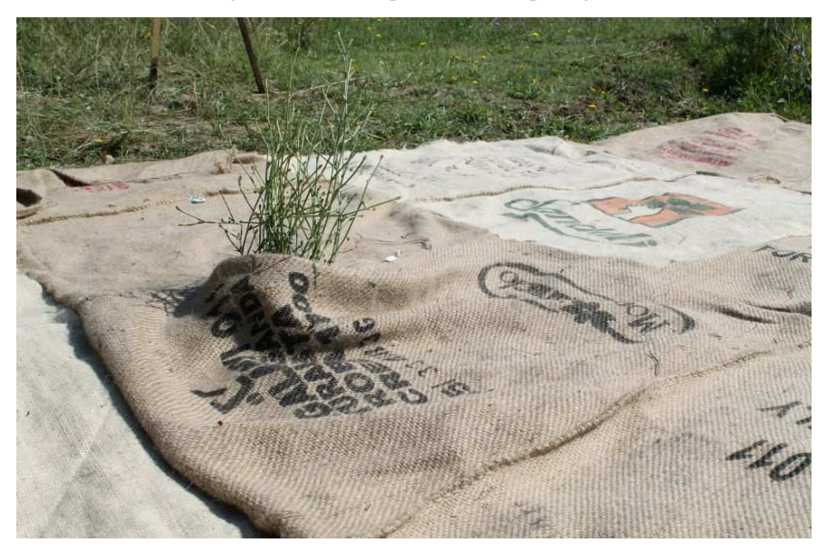
Fig. 9: Spontaneous growth of plants in the garden.

Considering again Clement's theory, participants no more played the role of architect sculptors but that of garden makers with the only purpose to accompany with their own projects transformations already present in that place.