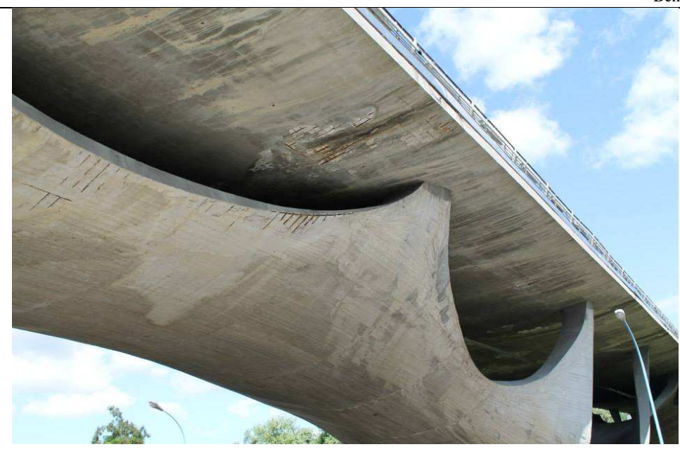
Fig. 5: An external view of Musmeci Bridge.

This bridge was built at the end of the sixties of the last century and it is one of the few elements of architectural interest in Potenza city.