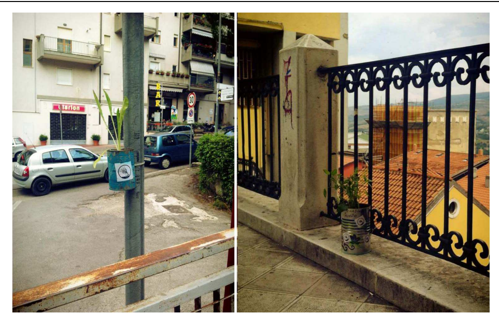
Fig. 4: The urban game created to promote the initiative in the city and to engage citizens.

Some plants, for example, have been disseminated in the city, photographed, geolocated, posted on the internet. Without receiving instructions, citizens began to track the traces of the game, joining to the story.