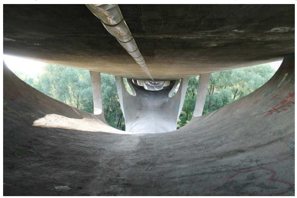
Fig. 2: The underside of Musmeci Bridge.

The choice of the area to be regenerated is not random: it is an abandoned area, forgotten by the institutions, behind a monument of great architectural value, but almost unknown in the city, Musmeci bridge.