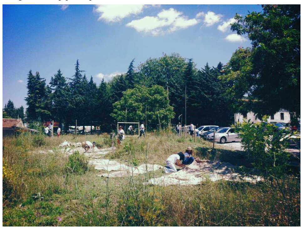
Fig. 1: Citizens working to realize the "Garden in motion".

Digital approaches and technologies also allow to build a strong storytelling of community actions, able to go much farther than city limits. It is possible to build an internal engagement, to activate citizens on projects or choices and produce circulation creativity and knowledge. It is no longer to promote actions or projects, such as a marketing bottom-up participation.