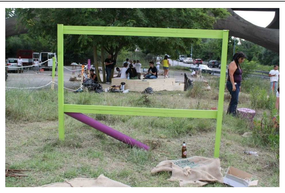
Fig. 6: Garden in Motion Building.

In this perspective, the "Garden in Motion" initiative has given (and continues to give) its contribution in the activation of some processes of great importance for the life of a community, just like in Gilles Clément's Garden in motion, where the processes of nature are favoured and spontaneous plants put in condition to grow and move freely. The interest in the monument and the participation to social dynamics are like seeds of wild plants sown in a field.