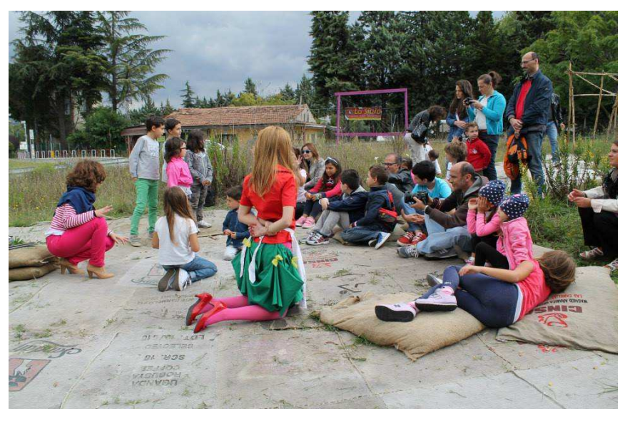
Fig. 10: Shows for children organized in the Garden.

completely abandoned today. Under the bridge there is an dismissed industrial area with green spaces, which requires a reconversion. The location of the industrial area on Basento river dates back to post World War II, when some mechanical and steel industries have been located in this zone taking into consideration the proximity of the area with the railroad which connected the city of Potenza with Tyrrhenian and Ionian coasts. The importance of this area is crucial because, due to the worldwide economic crisis, a lot of activities have been abandoned. Consequently the area could be converted to leisure, sports and cultural activities. The motivation is due to the position. This area has a good level of accessibility, it is one of the few flat zones of the city, it is close to Rossellino park, it is close to a Roman bridge (Saint Vito bridge), it is very close to a zone where an important participatory process of reconversion to park of an old pig breeding (Murgante 2012) is on-going and the municipality has also a project of a fluvial park around the Basento river. For this reason, the most important cultural associations of the city, since several years, organize many cultural events in the area to attract media attention to the zone and to remind its importance to the whole city population.