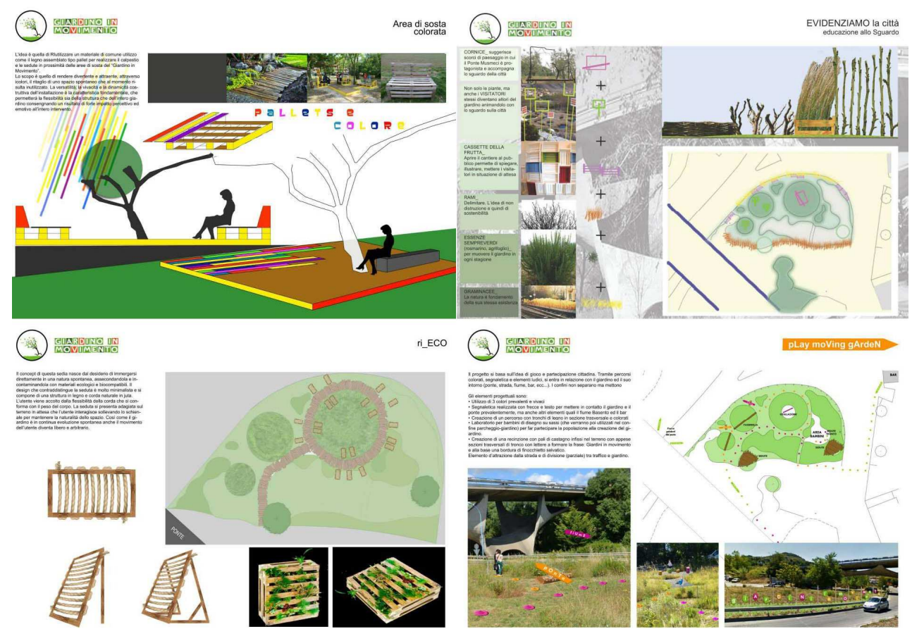
Fig. 8: Several examples of workshop designs.