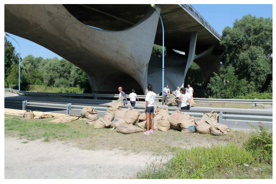
Fig. 7: Garden in Motion Building.

All this brings us to an issue dealt with by Lefebvre: the Right to the City.