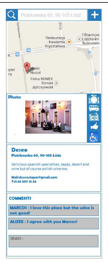
Fig. 2: The exemplary screen of the U-Place application.