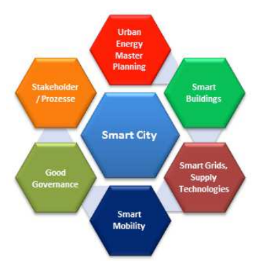
Fig. 1: Understanding of smart cities in Switzerland (Smart City Schweiz, 2014b).

In Switzerland, a smart city is understood to be a city which provides the maximum available quality of life at minimal use of resources thanks to intelligent connections of infrastructure (transport, energy, communication) at different hierarchical levels (building, quarter, city; Smart City Schweiz, 2014a). A smart city links topics such as urban energy master planning, smart buildings, smart grids and supply technologies, smart mobility, good governance and stakeholder processes (see Fig. 1).