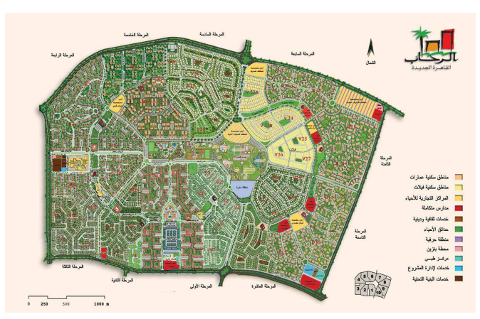
El-Rehab city Master Plan

Primarily intended for the lower middle class in the mid nineties. Upon its success, it was transformed into one of the most expensive communities. An escape from the original crowded, overpopulated, noisy and polluted districts. Switching home from an apartment to a villa, residents chose El-Rehab city seeking for a better quality of life; private, quiet, green, and healthy environment, with all services included. One of the most successful aspects on which it was based on is the provision of services and transportation of bus lines to and from and from Cairo.