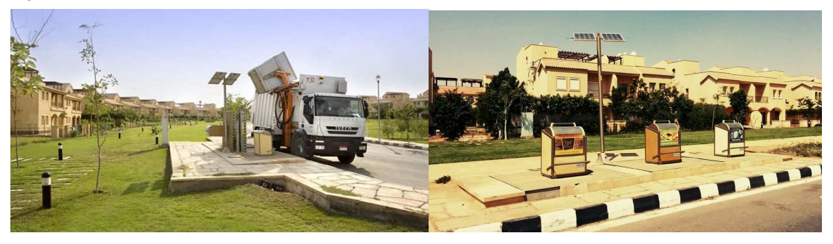
waste managment and solar panels

Seems also environmental smartness in Madinaty is in its birth phase. However, the city proved to be on the track, with respect to the application of renewable energy, reducing environmental stress, recycling, waste management, minimizing resources. However, there proved to be no clue on the monitoring and decreasing environmental impact. There seem to be lack of awareness with respect to the concept of environmental smartness, as a core, basically- which is a dilemma in the Egyptian paradigm in general. Solar panels appeared here and there, use of recycled water was obvious, however, many other environmental aspects are missing.