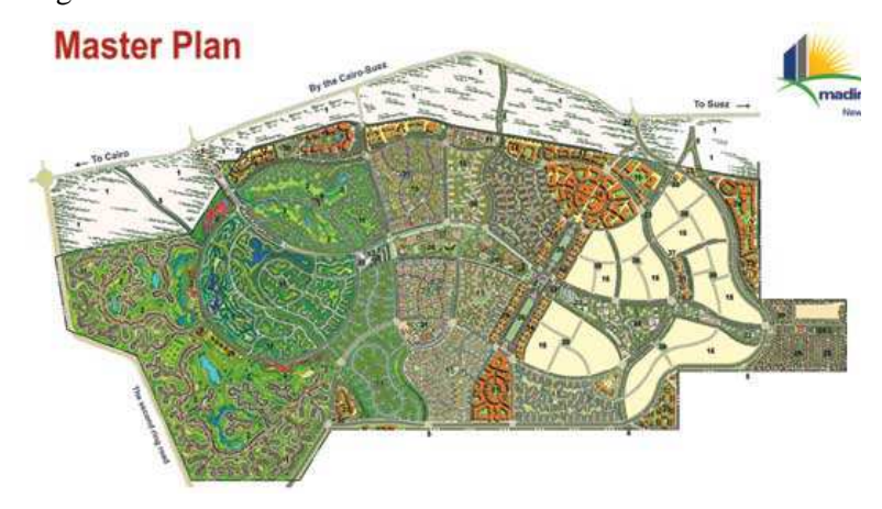
Madinaty Master Plan

Madinaty that provide major services; open-air shopping areas (like the promenades, for pedestrians only) or malls for international brand names. Technology is utilized to optimize the water used for the irrigation of the existing gardens and golf courses available.