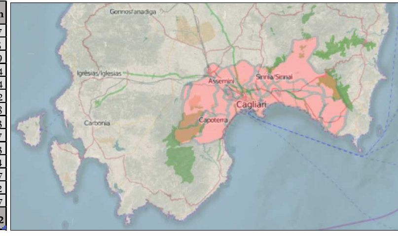
Fig. 1: Population distribution (left) and extension (right) of the metropolitan area of Cagliari.

The economy of the province of Cagliari is based, in order of importance, on trade and services, industry, and agricolture. In 2013, a note of the Bank of Italy reported a significant contraction of the regional GDP (-2.8%) and underlined the awful situation of the construction sector caused by both strong decrease in demand of new residential properties and reduction in public investments, as confirmed by the Sardinian section of the Italian association of building constructors (ANCE SARDEGNA), that registered that the sector had hit its worst state since the last forty years. As exposed below, this economic condition is fully reflected in the current state of Cagliari's housing market.