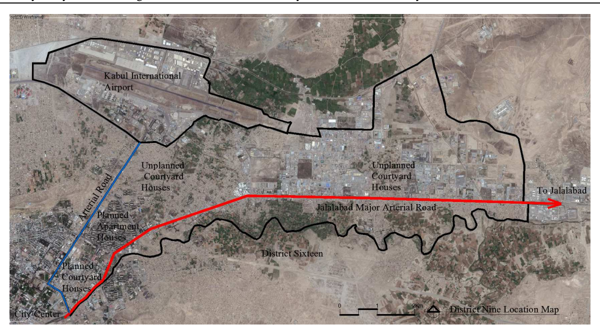
Fig. 2: The location map of District nine