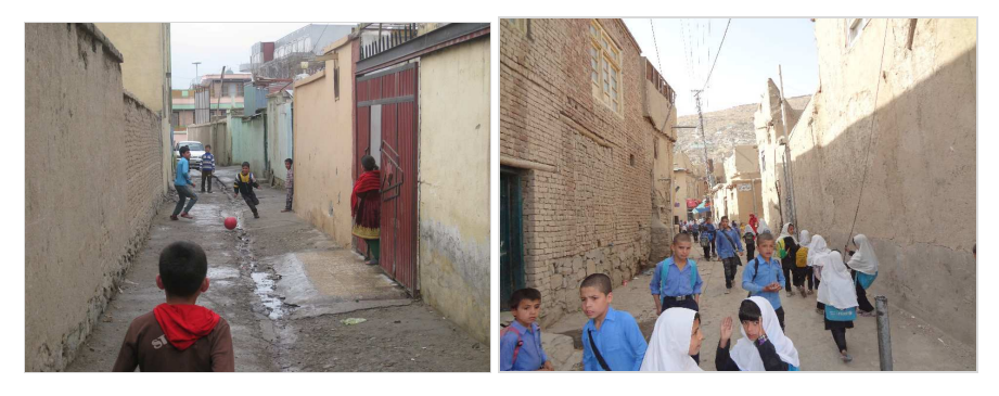
Fig. 3: An example of unplanned area, left: children are playing in the alley near their houses, right: pupils walking back to home

Unplanned areas lack proper open spaces for parks and playgrounds. Children often play in the alleys, near the main roads or at the vacant lands.