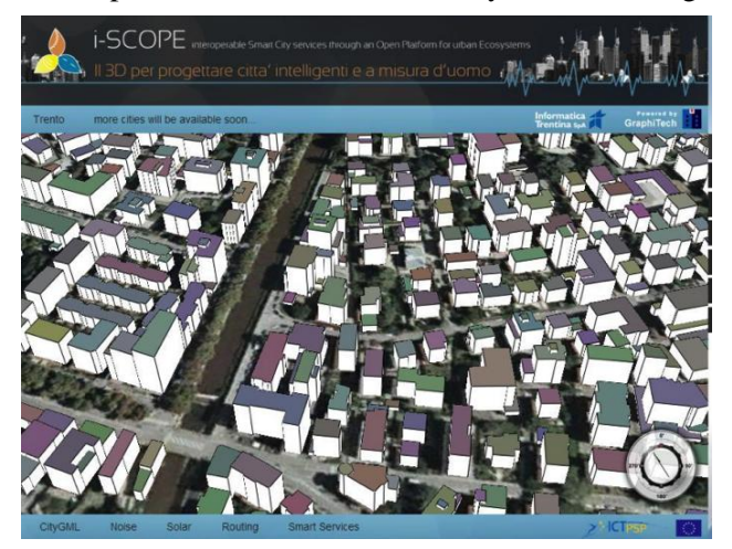
Image 1: LoD1 model of Trento visualized into i_SCOPE 3D environment

Visualisation is a complex and important issue in 3D city model applications. Efficient visualisation of 3D city models in different levels of detail (LODs) is one of the pivotal technologies to support these applications and it is fundamental to visualise the urban environment in different scales, e.g. from overview scale like a region down to detailed scale like a building or even a room. Furthermore Internet has become a basic information infrastructure all over the world even for the deployment of new smart cities technologies. Therefore, it is necessary to develop methods to visualise 3D city models through the Internet (fig.1).