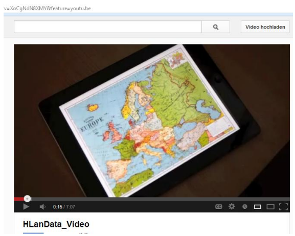
Fig. 1: Hlandata Promotion Video - Introduction

The HLanData geoportal is the gateway to harmonized land use and land cover data stored and maintained in different sources across Europe. It provides a map viewer to overlay and compare spatial data, and a metadata catalogue that allows to search and to find available data. The HLanData geoportal follows the principle: one centralized access to decentralized data. Your benefit is that there is one common legend. Due to the harmonization of the data according to common standards on the HLanData geoportal you can easily view different land use or land cover data from Europe together in one map. Moreover, you can have a cross-border view. Harmonized data is a key input for integrated and holistic analysis for example in regard to environmental, mobility, economic, and social issues.