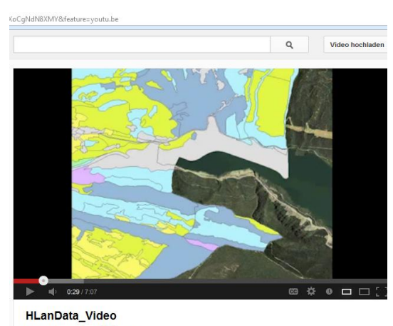
Fig. 3: HLanData Promotion Video - HlanData Pilots providing advances analysis functions

All these applications will profit from sharing harmonised data and advanced, but easy to use tools for data exploration. The services that HLanData offers are addressed to any user of this type of information, particularly technicians of the public authorities; decision makers; private companies; researchers; NGOs; planners; GIS analysts; consultants; architects and engineers but also the general public. That is why we go for free and open technology via web, providing decision makers with information about land use and land cover.