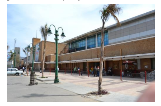
Fig. 6 The new facade with new finishing materials over the old train sation building causing aesthetic pollution.

From another point of view, the new design had to encompass the old building and to cope with it in harmony, which was never accomplished in reality, fig.6.