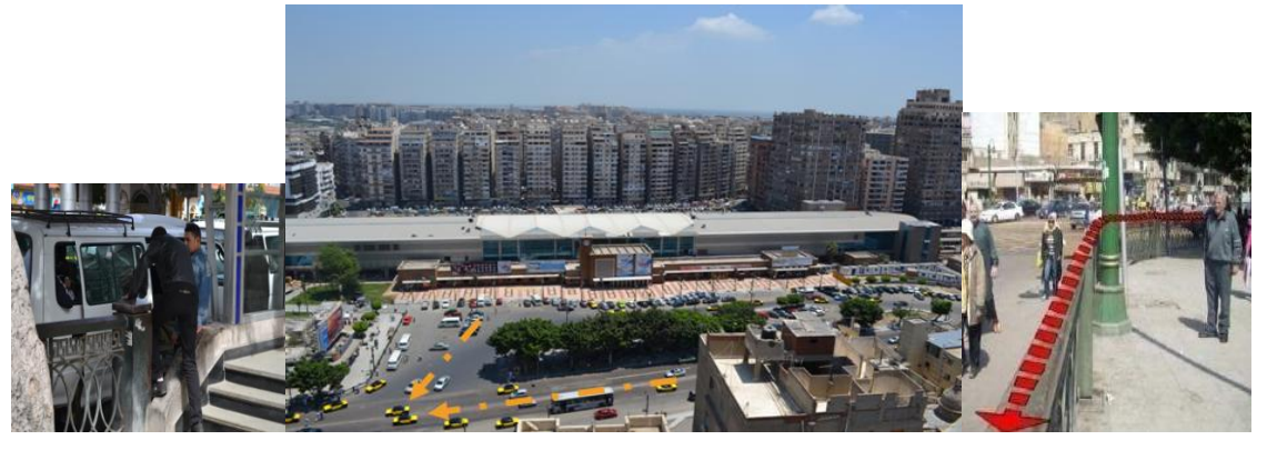
Fig. 9: Different circulation flow of people going to and from station with an obvious disorder.

Norman Foster design in Santa Giulia provides a very safe pedestrian condition, thanks to the addition of clear walking paths and the public surveillance from the presence of stores.<sup>9</sup>