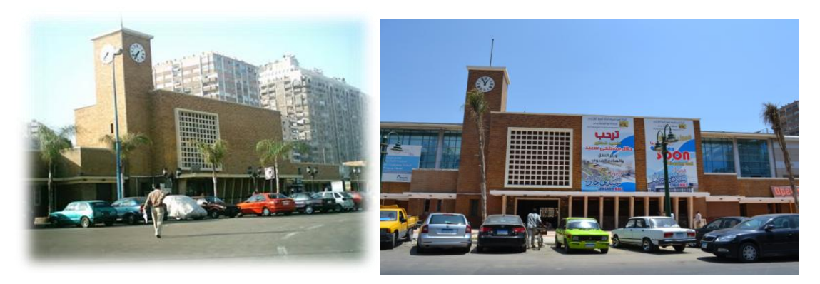
Fig.3: the old and new facades of Sidi Gaber station.

The famous train station building has a special architectural style and unique Dutch character building that was constructed instead of the traditional old wooden one, in 1948 and was built with yellow brick. The station is distinguished with a clock tower, and major map in front of it a showing the main streets of the city of Alexandria and the most important tourist attractions.