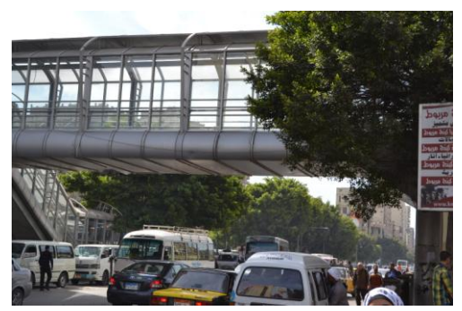
Fig. 7 the pedestrian bridge that in reality is not used by people.

Pedestrians usually cross the street from extremely critical access that is in conflict with vehicles traffic. In order to eliminate such behavior, the local authority constructed a pedestrian bridge and escalators that in reality are not used by pedestrians according to previous studies, fig. 7.(7)