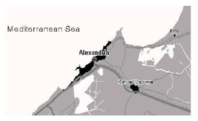
Fig. 1: Area of Study.

Alexandria witnessed a continuous urban growth from the beginning of the Mohammed Ali era (1805) up to the present time. In 1905, Alexandria's 370 thousand inhabitants lived in an area of about 4 km2 between the two harbors. Since that time the city has expanded rapidly, eastwards and westwards, beyond its medieval walls. It presently occupies an area of about 300 km2 and has a ten-fold increase in population at 4million, with a density exceeding 1,200 per km<sup>2</sup>.<sup>2</sup> Population is projected to become 5.4 million by 2015 (Figure.2). Because of this, Alexandria is the second largest urban governorate in Egypt. At an international level, the city was ranked 62 in 1996 and it is predicted to become rank 54 by 2015.<sup>3</sup> This enormous urban growth requires precise detection with good management, prediction and planning to solve circulation and traffic problems especially in the city center.