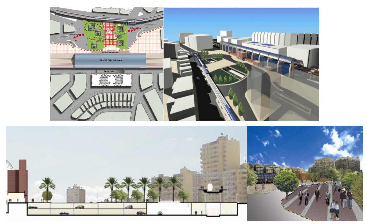
Fig. 10 the proposed plaza in front of the train station to solve the problems resulted from the new development project of Sidi Gaber.

The proposed project composed of either greenspaces represented in vegetated land or water elements and greyspaces represented in paved or hard landscaped areas with civic function can be an enhancement to the urban structure of this central crowded part of Alexandria, Egypt, fig.9.