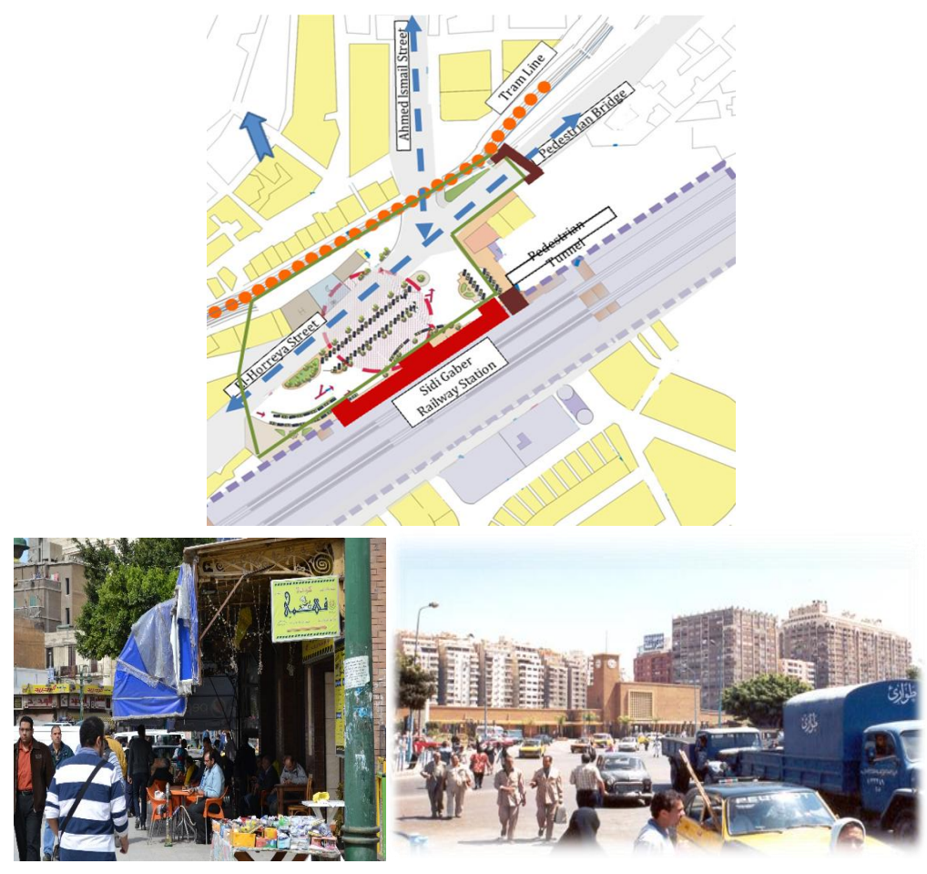
Fig. 8 : Pedestrians crossing Horreya street to arrive at Sidi Gaber with higher flow.

In urban spaces, people must be the decision makers, and they are free to choose their next steps. Where spaces are supposed to be designed to meet pedestrians' needs and support their activities. Most of our urban spaces are not giving pedestrian movements the enough priority and that cause a mis-use problem.