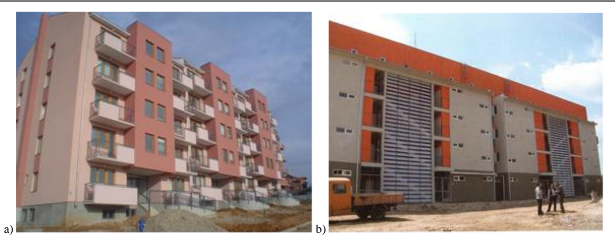
Fig. 2: SIRP programme – Social housing in a) Nis built in 2007 and b) Kragujevac built in 2007.

Although social housing buildings were built at urbanisticaly and morphologically different sites (Fig. 1, Fig 2, Fig. 3 and Fig. 4), thus unique and recognizable, there are some common characteristics of these sites and buldings, such as: