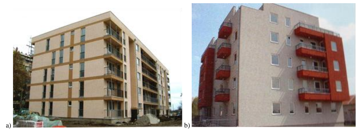
Fig. 1: SIRP programme - Social housing in a) Pancevo built in 2008 and b) Stara Pazova built in 2007.

The series of architectural and urbanistic competition were held during 2005 and 2006 in order to get the best design solutions for the social housing buildings. Serbian architects showed great interest on this topic, which resulted with over 130 competitional entries in total that were disposable on the seven SIRP competitions.