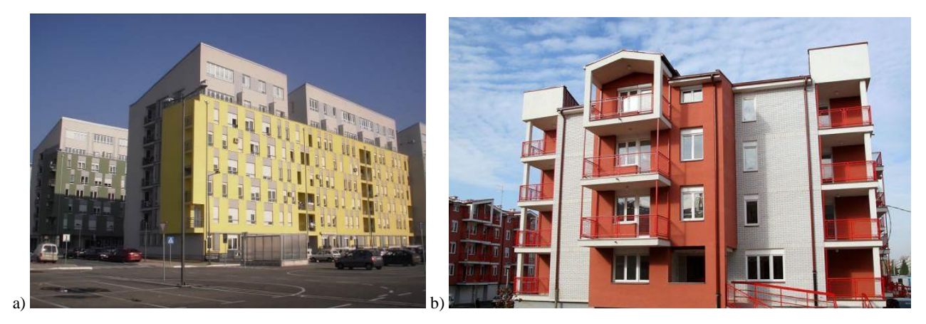
Fig. 6: Social-non-profit apartments in Belgrade – a) settlement Dr Ivan Ribar and b) Vojvodjanska street, both built in 2012.

Simultaneously, with the construction of social-non-profit flats started the construction of social apartments for renting to people in state of social need in locations: settlement Dr Ivan Ribar (Fig. 7a), Kamendin and Veliki Mokri Lug (Fig. 7b). From the beginning up to today 450 social apartments has been built in Belgrade.