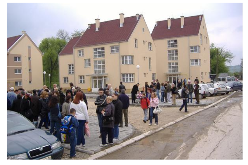
Fig. 3: SIRP programme – Social housing in Cacak built in 2008.

User households that were chosen through a transparent system of criteria and selection rules are: refugees, former refugees and local socially endangered population (single parents with children, homeless, families who lived in the inadequate housing conditions, etc.), which means that a social mix have been achieved, according to the European social housing practice.