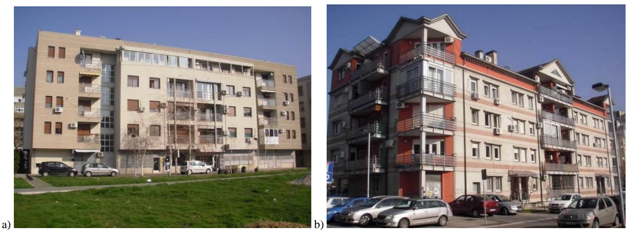
Fig. 5: Social-non-profit apartments in Belgrade – a) Retenzija built in 2006 and b) Vojvodjanska street built in 2007.

First of such projects was "Project of 1100 flats in Belgrade" in 2003. This project was accompanied by the Decision on conditions and manner of disposal of apartments built according to project "1100 apartments in Belgrade".<sup>10</sup> The ownership of apartments would be still in the governmental hands, but the City of Belgrade could offer it for sale (1000 flats so-called "cheap flats") or rent for the certain period of time to the persons with clearly defined social needs (100 flats – Public Rented Housing), Project was done on the basis of analysis of various available locations owned by city Council, namely Cukaricka padina, Retenzija (Fig. 5a), Vojvodjanska Street (Fig. 5b) and Olge Alkalaj Street. The project was finished by 2007.