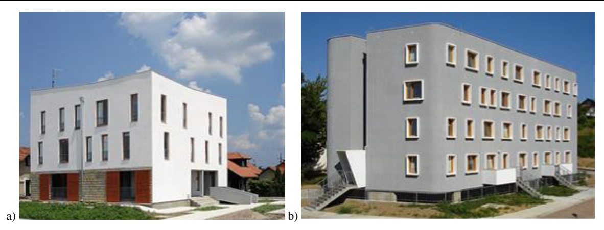
Fig. 4 a) and b): SIRP programme - Social housing in Valjevo built in 2008.