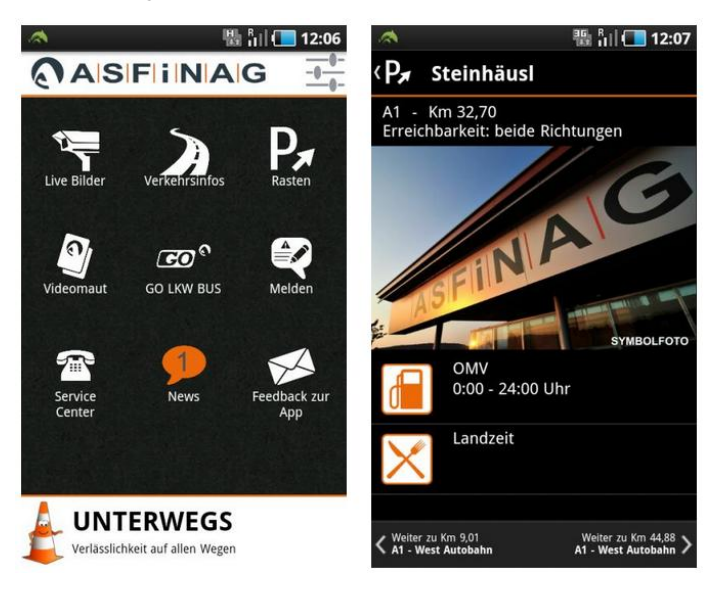
Figure 4: Mobile Internet ASFINAG

From ASFINAG point of view sustainable mobility can only be achieved by measures along all three intervention-axes: vehicle – man – infrastructure. In multimodal transport networks of the future, users choose from the most comfortable and best suitable transport-facility for the particular route, travel purpose and the current traffic situation (eg unavailable route because of roadworks). Successful application of multimodality in daily life requires integrated route planning, reliable knowledge of the current traffic situation and well directed alternative options. For those pursoses powerful communication and information solutions are necessary. A variety of different traffic information services are currently available to road users in Austria. One oft he most efficient services will be the "Traffic Information Austria (VAO)", a