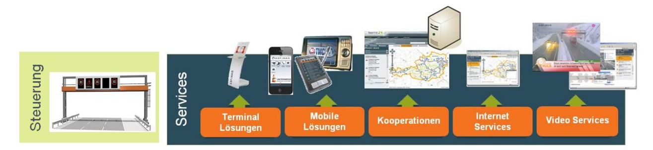
Figure 3: Traffic information services ASFINAG

Standalone-Informationtechnologies of today will continuously be replaced by integrated centralized services. Multimedia service for traffic information is provided on uniform, standardized platforms and available for customers by mobile devices and digital broadcast services.