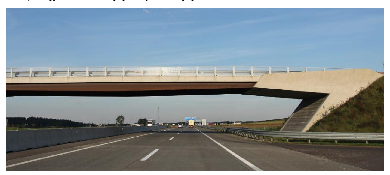
Fig 5:. Construction of Motorways has to deal with building culture