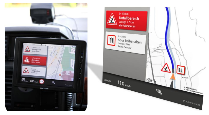
Fig. 1: "Car-to-Infrastructure" - communication

integrate different modes of transport and to provide efficient interchanges between private and public transport.