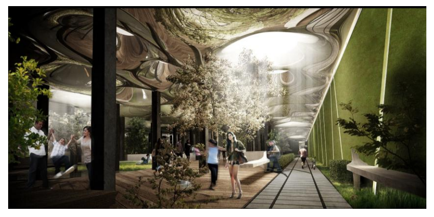
Figure 1: artist impression of the Lowline NYC (US), courtesy of RAAD Studio

We will reveal that just like lost spaces in cities, underground spaces are unappreciated and often misjudged in terms of their potential. But just as with lost spaces, there are citizen initiatives which unlock the potential of underground spaces. The Lowline project in New York is a prime example of this (figure 1). The concept involves reusing a former, now disused underground tramway depot and unlocking its potential as a new public space in form of an underground park.