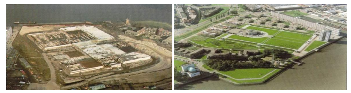
Figure 2a and 2b: Dokhaven redevelopment Rotterdam (NL) before and after completion

Inner city docks can become industrial wastelands when they lose their original function. They often influence the urban landscape surrounding them negatively as many examples worldwide illustrate. Revitalizing these areas can be a major challenge. In the city of Rotterdam a former inner city dock was reused in an innovative way. After closing off the dock from the river and pumping out the water, the space which was lost under water was reclaimed. A waste water treatment plant was then built in that reclaimed space. After completion the plant was covered and a city park scape created (figure 2a and 2b). This allowed for further urban development in an area which would have lost all its attractiveness had the plant been built on the surface (Cornaro & Admiraal).