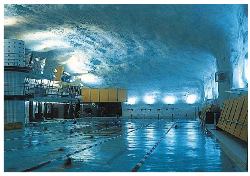
Figure 6: Itäkeskus Swimming Pool, Helsinki (FI)

Planning the use of underground space from a wider perspective is paramount to the sustainable development of underground space. But in itself it's not enough. Underground space also needs to be actively managed because of the various resources that it contains, space being just one of those. Although most of underground space might be seen as lost space, it contains an enormous potential for cities if planned and managed in the right way. Not doing so will ultimately result in chaos and prevent future development and use.