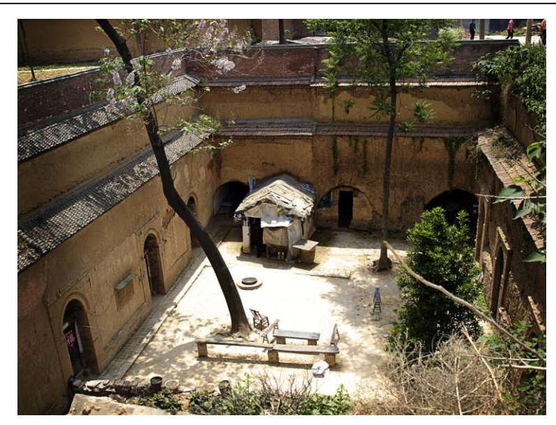
Figure 3: example of a Yaodong, China