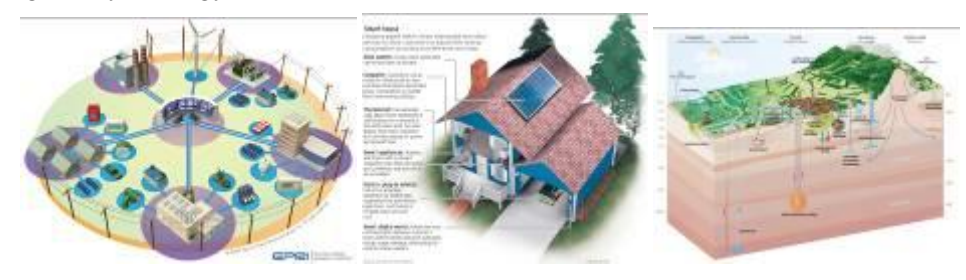
Figure 3 (left): This diagram of a smart grid illustrates in which way local energy sources, buildings and electrical vehicles are interconnected. Figure 4 (middle): The common situation of a house that is connected to the power grid only to consume energy might be outdated in the near future. A smart home connected to the smart grid will be able to upload, store and download energy in a way similar to the internet. Figure 5 (right): According to Rifkin, geo-thermal energy is one of the renewable energy resources necessary for a clean economy in the Utrecht Region 2040

2040: importing 120,000 freight vehicles a year carrying biomass or 1600 large-scale wind turbines in the beautiful open landscape. Given the spatial complexity of the Province of Utrecht previously referred to (densely populated intersection of road, railway and waterway network, nature/landscape) this is not a realistic prospect. But providing the room for energy and other forms of innovation and for large scale generation of sustainable energy is probably the most important pre-requisite in relation to the province's core task in the spatial domain. The province itself cannot develop any sustainable or conventional energy projects. It will be the market players, such as project developers, power generation companies, housing associations and groups of residents who will do that. The task of the province will be to provide clarity at an early stage for these parties regarding where they can develop their initiative. This is what the Provincial Spatial Planning Policy Strategy is intended to do.