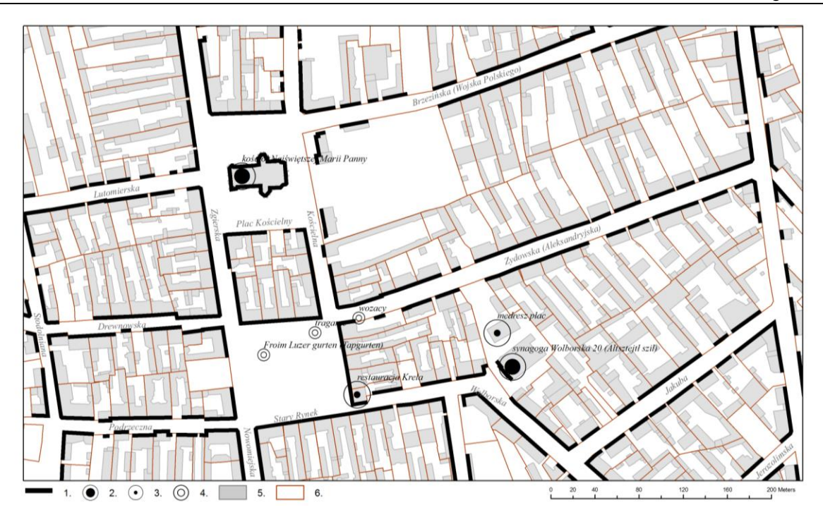
Fig. 3: Nonexistent appearance of the central part of the old Jewish district: 1. frontages, 2. distant landmarks, 3. landmarks, 4. special places, 5. buildings in 1939, 6. parcellation in 1939