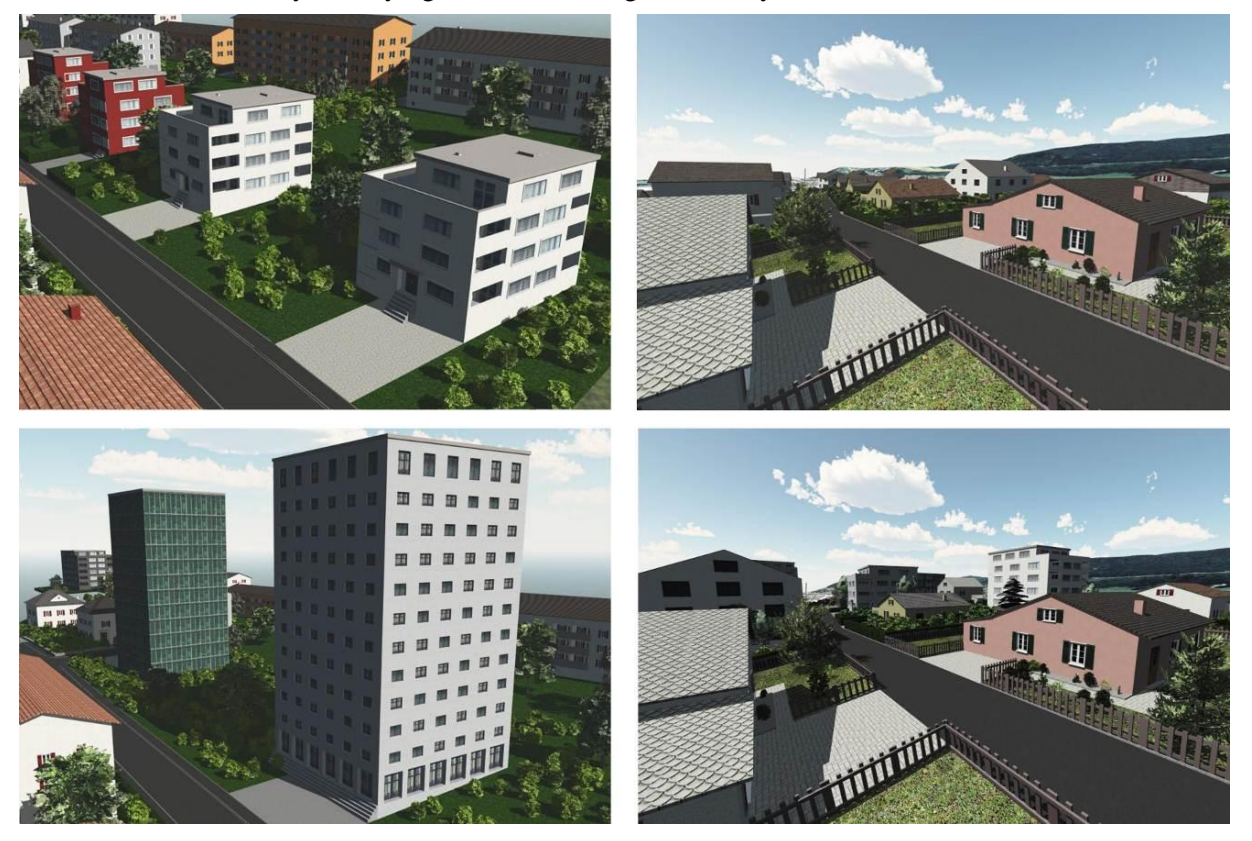
Figure 7: Example of different close up camera positions of two scenarios generated in ESRI's CityEngine.

Although the CityEngine system generally supports interactive change of scenes, for real interactivity in participatory situations the need of system recourses is a hindrance. For generating the scene, a 24GB Ram Workstation with high-performance GPU and CPU was used. For large-scale visualization with included vegetation such a configuration is necessary to handle the changed model parameters re-rendering rapidly. In interview situation we had to use a mobile device, which has a comparatively bad system performance. Therefore, a preparation of the scene was inalienable – the renderings for all scenarios were done before the interviews and interactively modifying and re-renderings were only done for selected lots.