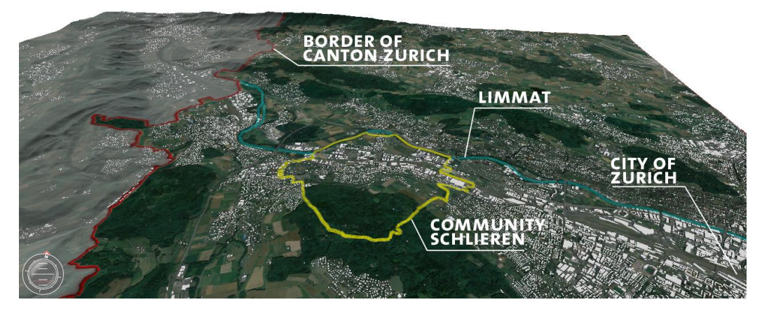
Figure 2: Overview of the community of Schlieren (yellow line) situated in the valley of the river Limmat. Red line marks the border of Canton Zurich with the city of Zurich in the lower right corner of the figure.

The 3D urban model is developed for the case study area Limmattal (valley of the river Limmat), an agglomeration in the northwest of Zurich (Figure 2). Special focus will be laid on a dwelling zone in the community of Schlieren. It comprises an area of about 6,38 km<sup>2</sup> and a population of 16'100 (about 2'462 inhabitants/km<sup>2</sup>) (Statistisches Amt des Kantons Zürich, 2010).