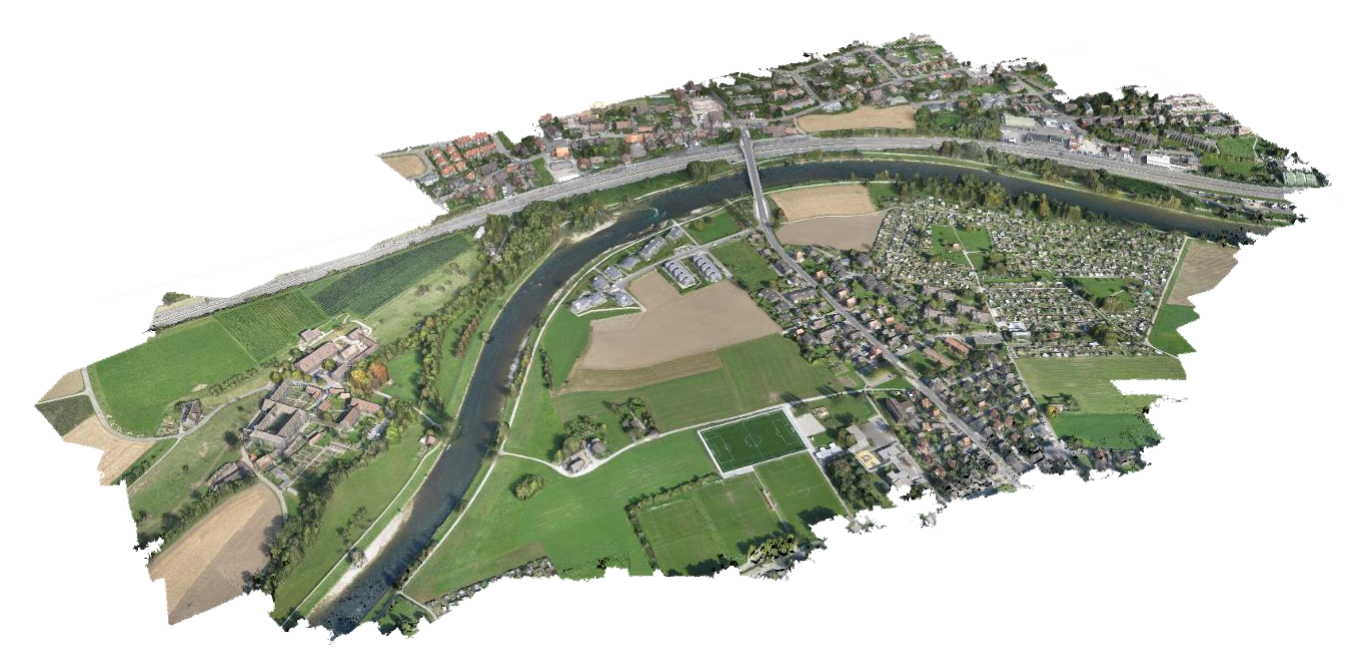
Figure 4: Processed high resolution digital surface model (DSM) with orthophoto texture of an Unmanned Aerial Vehicle (UAV). The data shows a part of the case study area of Schlieren (Canton Zurich, Switzerland) and has an accuracy of 8 centimeters (DSM and orthophoto).

(2) The unmanned aerial vehicle consists of a modified camera, GPS autopilot and radio module. Linked with a ground-based notebook, the fly path for the airframe is defined. The UAV flies autonomously by defined waypoints and heights over the terrain and takes images. Through exact trigger-coordinates and attitude of the images by GPS-autopilot and inclination sensors, a afterwards auto-processing of control points is possible to generate geo referenced surface models and orthophotos (Figure 4), (Manyoky et al. 2011).