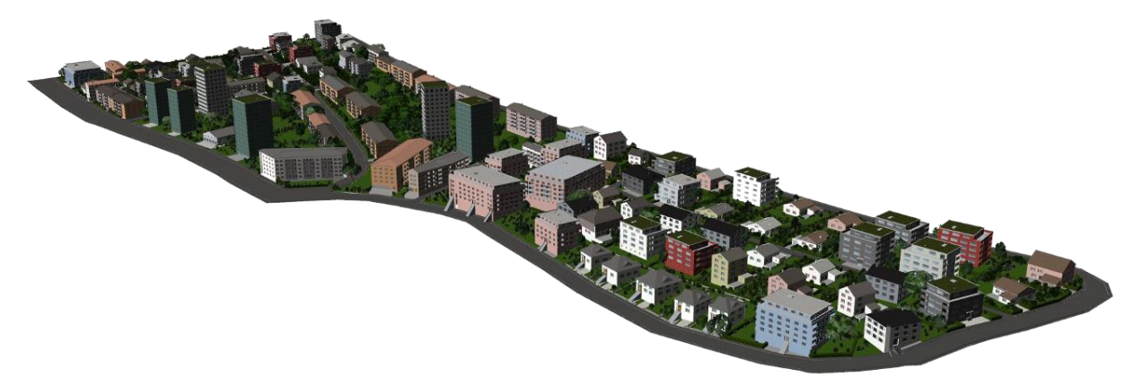
Figure 6: Example of a densification scenario generated in ESRI's CityEngine of the case study area in Schlieren.

In these interviews, the participative part was applied as a semi-interactive survey. This means, the model parameters were directly shown in CityEngine. Positive feedback from stakeholders supports that this helps to understand the scenarios and their coherence with the indicators. The option to change camera positions within the visualization to get a close distance view to dwelling zones of special interest or positions with special view axes (Figure 7) was rated as a positive feature.