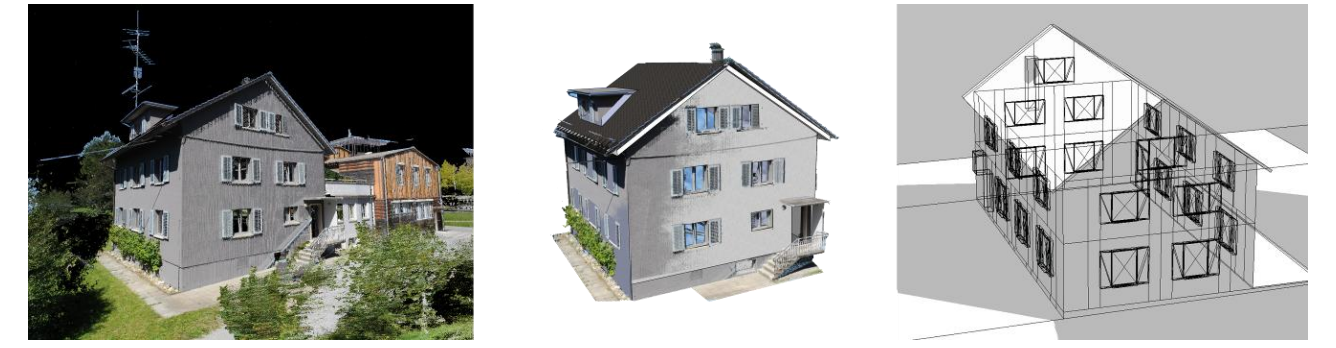
Figure 5: Colorized point cloud from terrestrial laser scanning (left), static 3D building object model based on point clouds (mid), example of a building type generated in the CityEngine system implementing CGA shape grammar rules (right).

Newer features in ESRI's CityEngine support import of geo-located Google Warehouse buildings (http://sketchup.google.com/3dwarehouse). However, 3D object models can also be generated from the TLS and UAV data. The data can be easily prepared and processed to get high detailed 3D objects and ground data. This workflow is useful for modeling static non-CGA based buildings, which won't be influenced in scenarios and support the stakeholders' in orienting themselves and thus contribute to the suitability of the model for assessing place identity (Figure 5).