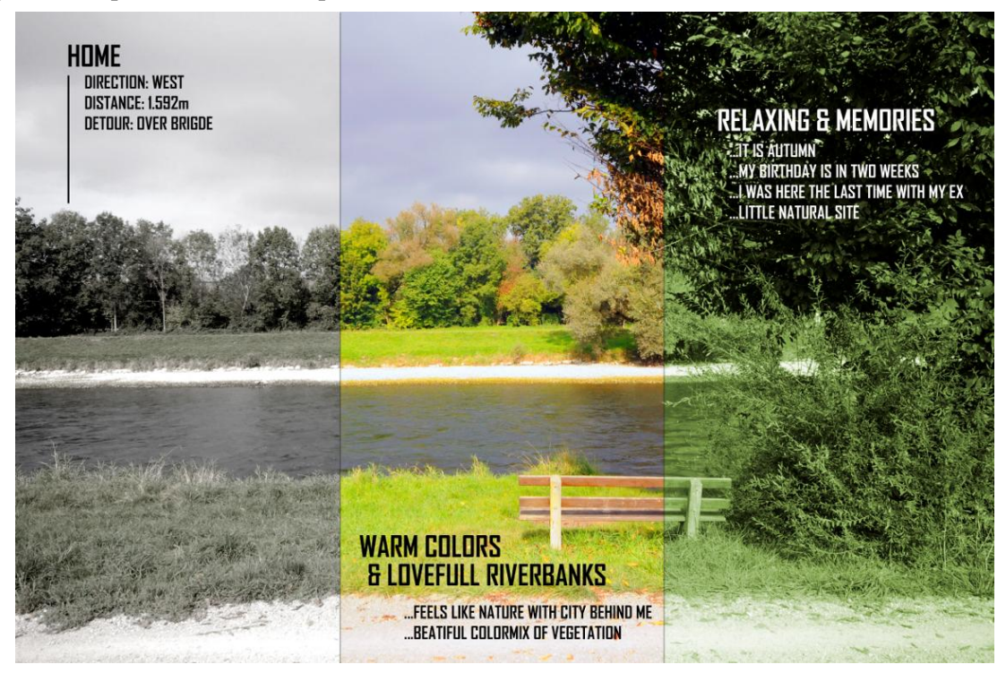
Figure 1: Illustration of the three component view of landscape perception.

Girot and Wolf (2010) describe the three components as analytical, physical and poetical view. The analytical view measures the spatial composition and builds relationships between objects. The physical one is described as a corporal experience of cognition. The individual touch is here given by the poetical component, which combines the viewing results to something new and gives them a distinctive attribute for dealing with compositions in landscape.