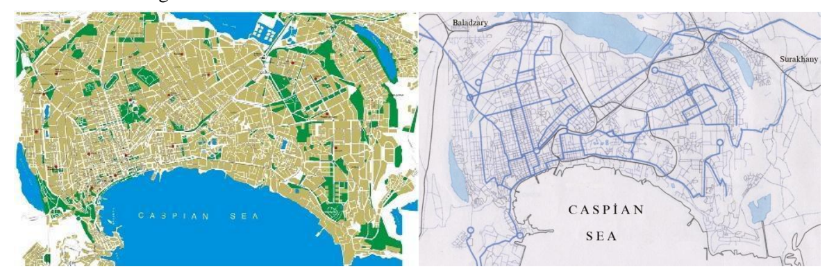
Fig. 2. Scheme of street road network of Baku

In addition, one of the main negative aspects is the uneven distribution of the car park around the regions of the country, which is typical for most of CIS countries. That is why, a complex situation regarding the environmental safety and organization of road safety has particularly emerged in Baku. Rapid growth of private car park should also be considered as one of the main reasons for this situation along with unsatisfactory road conditions. Currently, about 60% of the vehicles are located in Baku. It should be noted that the statistics do not consider the number of cars whose drivers are temporarily working and living in Baku without official registration. The accumulation of the main part of the car park in Baku creates huge problems, both in terms of traffic safety (occurrence of traffic jams), and urban air pollution. Proportion of the road transport vehicles in the total amount of pollutants' emissions into the atmosphere by all man-made sources is up to 75%, and the noise impact on the city's population is 85-90%. The greatest harm from air pollution is effecting people. International experience suggests that the biggest concern in this context usually causes such pollutants of the urban environment as lead and fine aerosols. These pollutants result from the use of leaded gasoline.