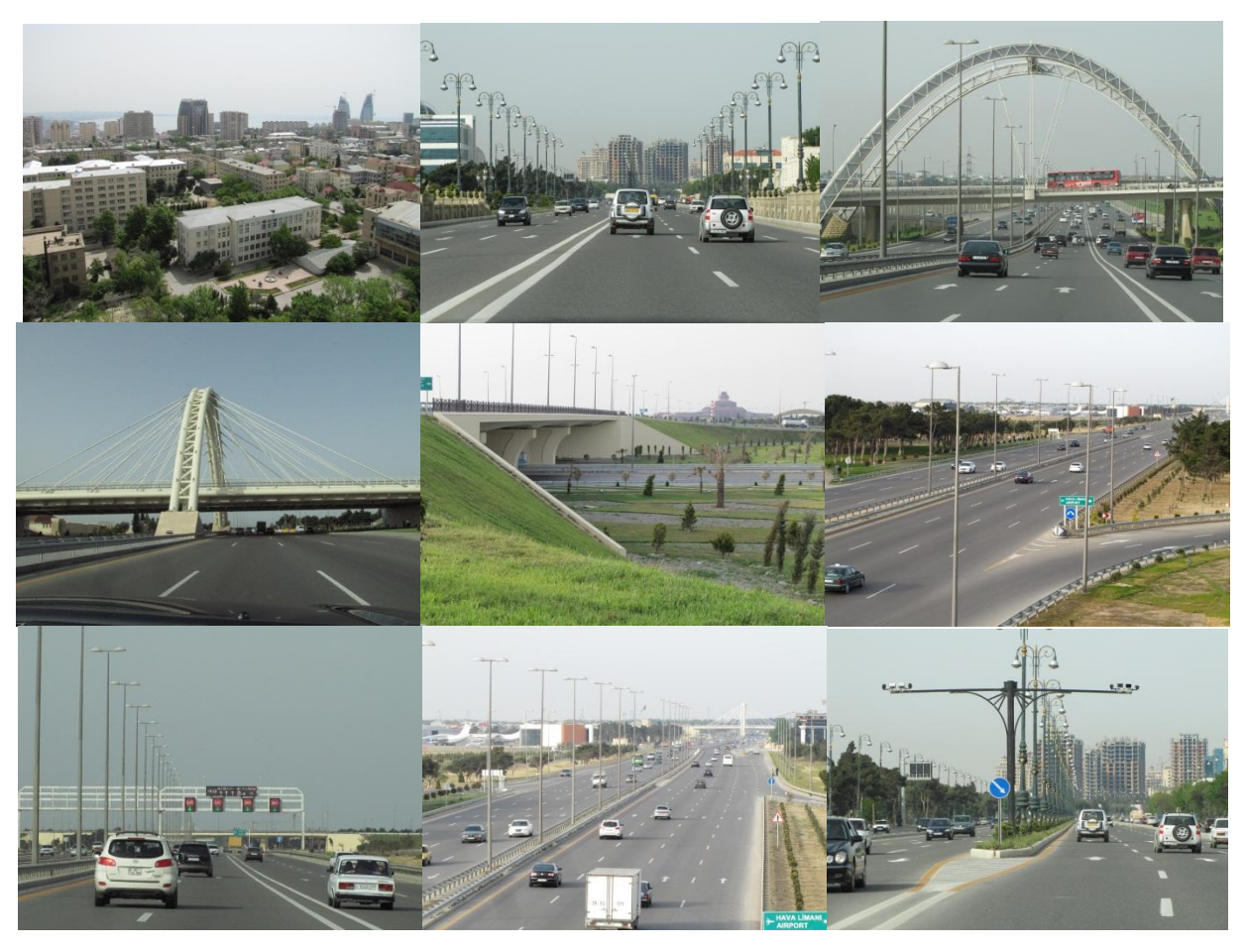
Fig. 3. Transport infrastructure of Baku city

All these methods and tools used in practice do not respond flexibily enough to the traffic conditions and do not provide radical solutions to environmental problems of road transport.