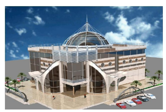
Fig. 4. Centre for Intelectual Controle of Transportation Process in Baku

In order to improve traffic management and to provide significant changes in the environmental impact of road transport in Baku the center of intellectual control of transport processes (cictp) has been introduced for explotation in December 2011. This is a comprehensive system of information support and management on land road transport based on the use of modern information and telecommunication technologies and management practices.