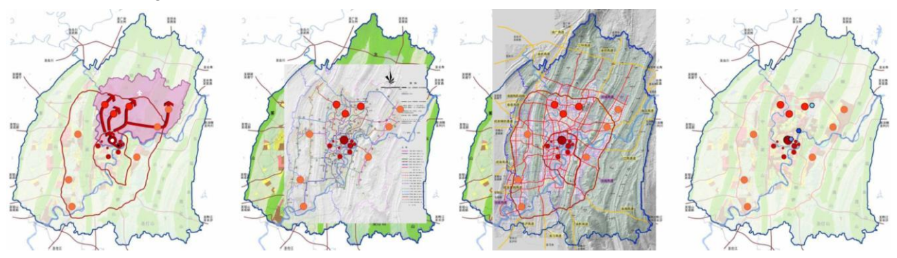
Image 1: Chongqing strategic urban area plan within outer ring road. The purple area in the left image is the "Two River" zone. In blue is shown the future outer ring road and red the ring road and orange the arterial roads system Red dots are centres. Arrows indicate growth trajectory. Second image shows planned MRT/LRT. Third image shows existing and planned trunk roads. Right