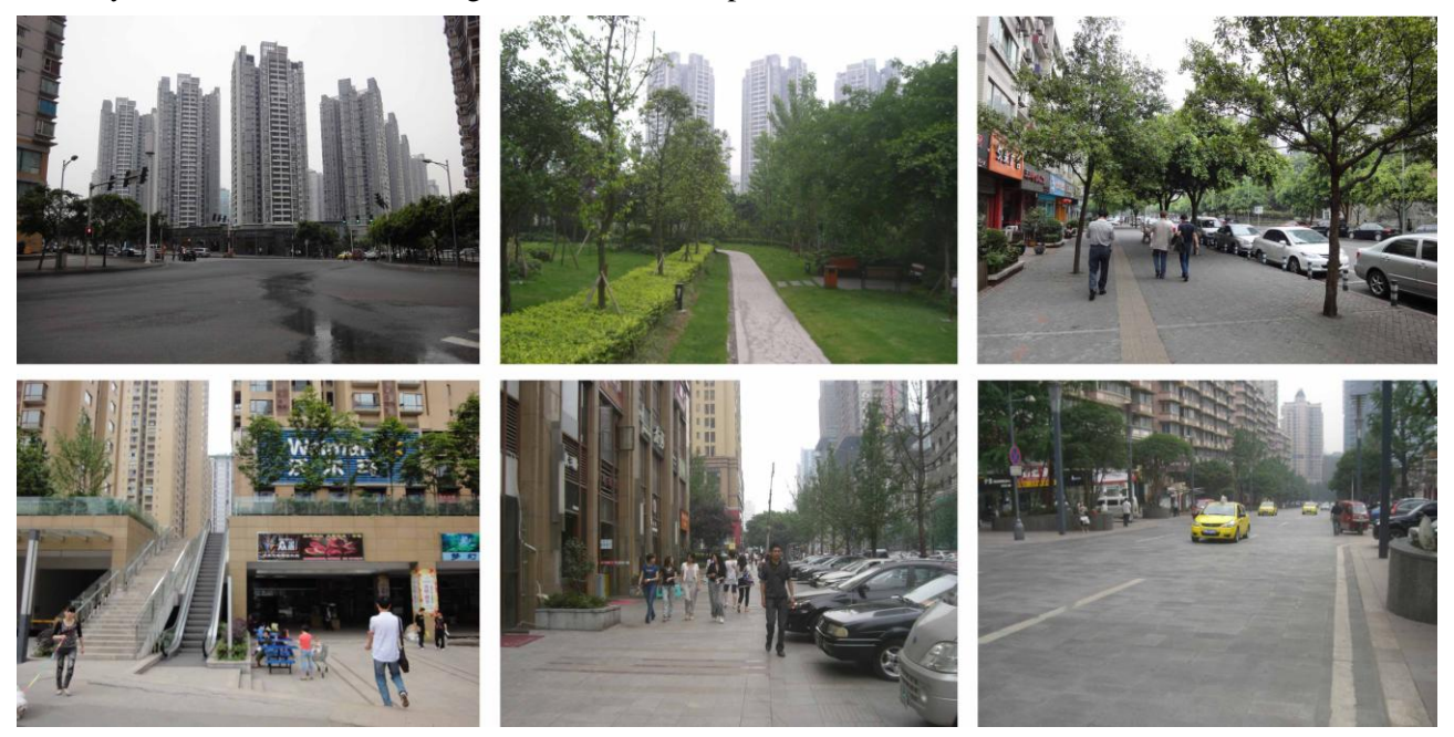
Image 2: High density developments in the area of the Jiangbei CBD. Pedestrian environment has some nice elements in some places already but need to be completed and connected to become a cohesive, convenient, pleasant and safe system: Pathways through green spaces. Beautifully landscaped and wide sidewalks with cars at times parked on them. Public stairs and public escalators enhance walkability. Roadways with Taxisand capacity to handle exclusive bus-lanes/BRT.

What has been the biggest concern of the local officials however, was vehicular accessibility avoiding roadway congestion and the planning of sufficient number of parking spaces as well as access to parking that avoids backlogs onto roads. The authors were very concerned about access via public transportation and in reviewing the transit system - existing and planned - major shortcomings on a systemic level were identified and they had to be overcome through innovative concepts.