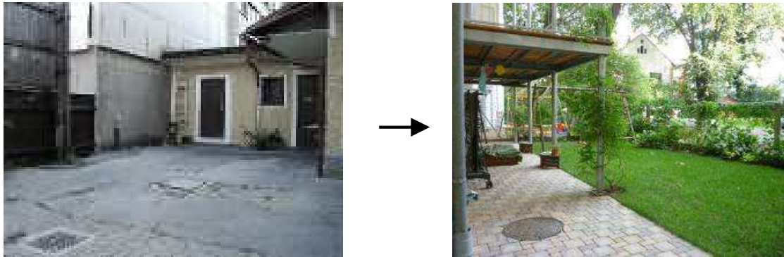
Fig.2: transforming the inner courtyards to green

shared courtyards are a common presence in the City of Graz. With their green inner courtyards and front gardens they help giving Graz the reputation of being a garden city. In the historical centre you will find semi-public and private open spaces, some of which are still intact with a lot of plants and provide a good micro-climate as well as improving the quality of life for the people living there. One of the key goals of the development concept of Graz is the conservation of these spaces and to motivate the private users on participate in an active and financial way.