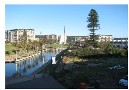
Figure 7: Point Waterfront Revitalisation Revitalisation Master Plan Figure 8: Point new development built environment

To realize the revitalisation of the Durban Point area and city centre the following design principles were adopted (Figure, 7 and Figure 8); an urban intensity of scale and an urbane character of development, a structure based on canals, water bodies, boulevards, vistas, urban squares, avenues, lanes and parks, all creating memorable places and an emphasis on mixed-use developments which encourages the integration of retail, commercial, office, entertainment and residential activities including safe, quality pedestrian movement spaces, and clean attractive and secure environment. But, regardless of all this, development integration has not been achieved by the revitalization of the Point area. The water canal next to the Indian Ocean is not really necessary as it increases the cost of the development, thus excludes most of the inhabitants of Durban who are in the low income bracket. A well positioned large pedestrian movement and square with hard and soft landscape would have created a more integrated urban character. Thus accordingly the key criticism of this project is of target group of rich affluent people which excludes the rest of the population. This is because prime land of estate is converted to expensive water use that requires high maintenance. Thus hybrid African cities concept has not been realized because of the exclusion of the poor and the determinist nature of the property markets and competitiveness of the city using grand architecture.