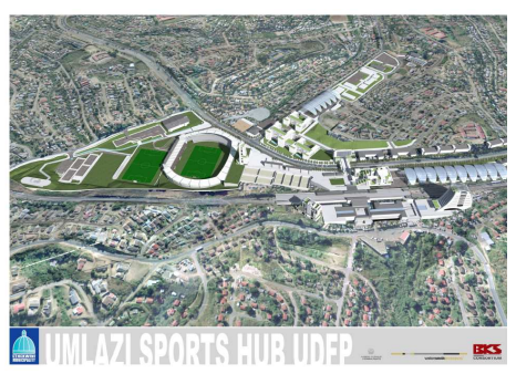
Figure 1: KwaMnyandu node Site Location, Figure 2: Concept Plan