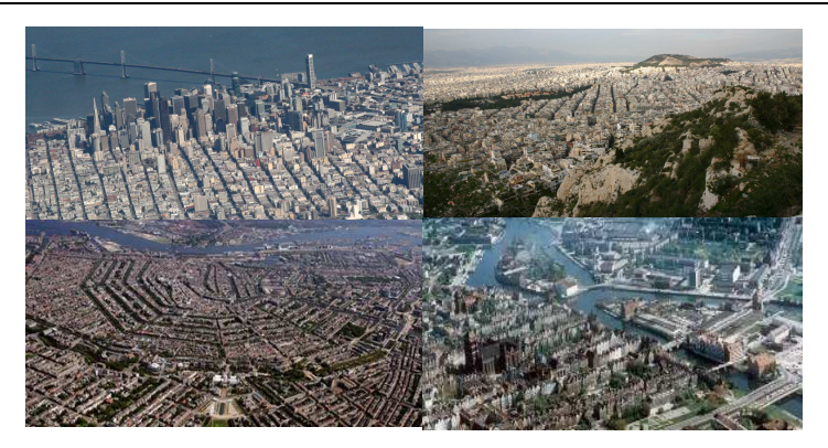
Fig. 1: Cities of San Francisco, Athens, Amsterdam, Gdansk