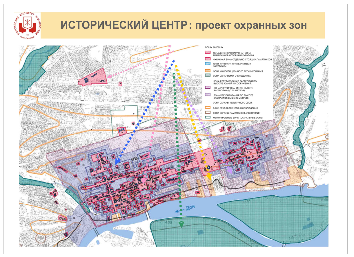
Fig. 5. Example of successful approach to preserving historical heritage. The project for central district of Rostov-na-Donu city.

With the procedure of public hearing on any urban planning document approval in place, the public opinion on the issue of historical monuments preservation has acquired some weight.