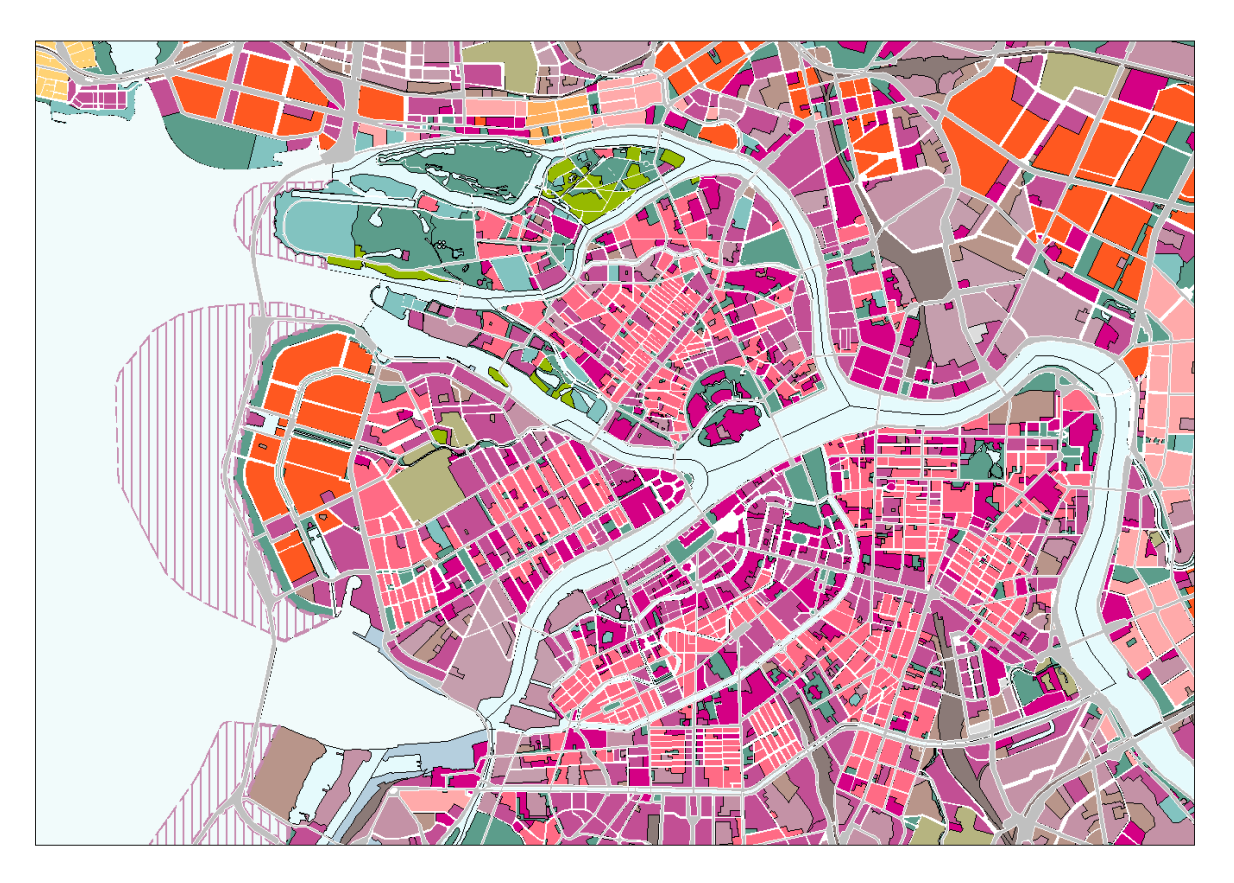
Fig. 4 Functional Map as a part of St. Petersburg City Genplan, 2005.

At present, proposals are being developed to update the 2004 Urban Planning Code.