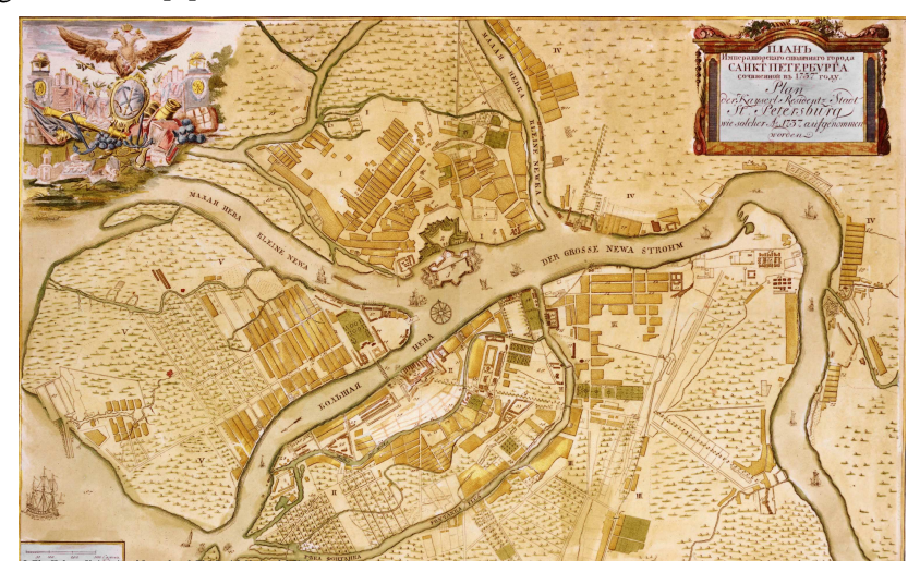
Fig. 1: St.Petersburg, 1737

During the recent three decades Russia has been a sort of a testing site for experiments in urban planning. In the early 18th century Peter I founded Saint-Petersburg, and the plan of the city was based on the idea of regularity. In the second half of the 18th century, the regular planning methods were spread to many cities of the Russian Empire. They were used both in building new cities and reconstructing old ones. During the reign of Catherine II, more then 160 (!) cities received "standard plans". The attitude to the city space was undergoing radical changes; this spave was strting to be formed by "street facades", rather than by auxiliary buildings bordering the estates [1].