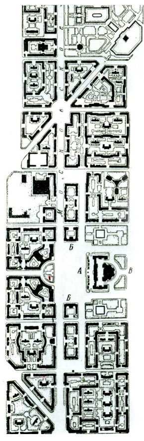
Fig. 2: The sample of micro-district space organisation: Moskovsky prospect, Leningrad, 1930s

Search for new urban planning solutions which had started in the 19th century Europe was also spreading to Russia. Many projects of "garden-cities" appeared, "cities for workers", which were partly implemented. However, the main obstacle for their implementation was private property on land. Land nationalization in 1918 made it possible to conduct large-scope experiments in this direction. The sample to follow was Le'Corbusie's type of design, with freely spaced buildings standing in green areas between motorways. The sample was reconsidered, and the intra-motorway area began to be viewed as a relatively enclosed social space, "a micro-district". In the 1950s-1960s the micro-district became the main method of urban space development in the USSR. Strict national rules were established for siting social infrastructure in such micro-districts, including schools, kindergartens, shops, health care institutions and sports grounds. Two generations of urban planners, up until 1991, were drawing, calculating, discussing and looking for optimal decisions for organizing micro-district space.