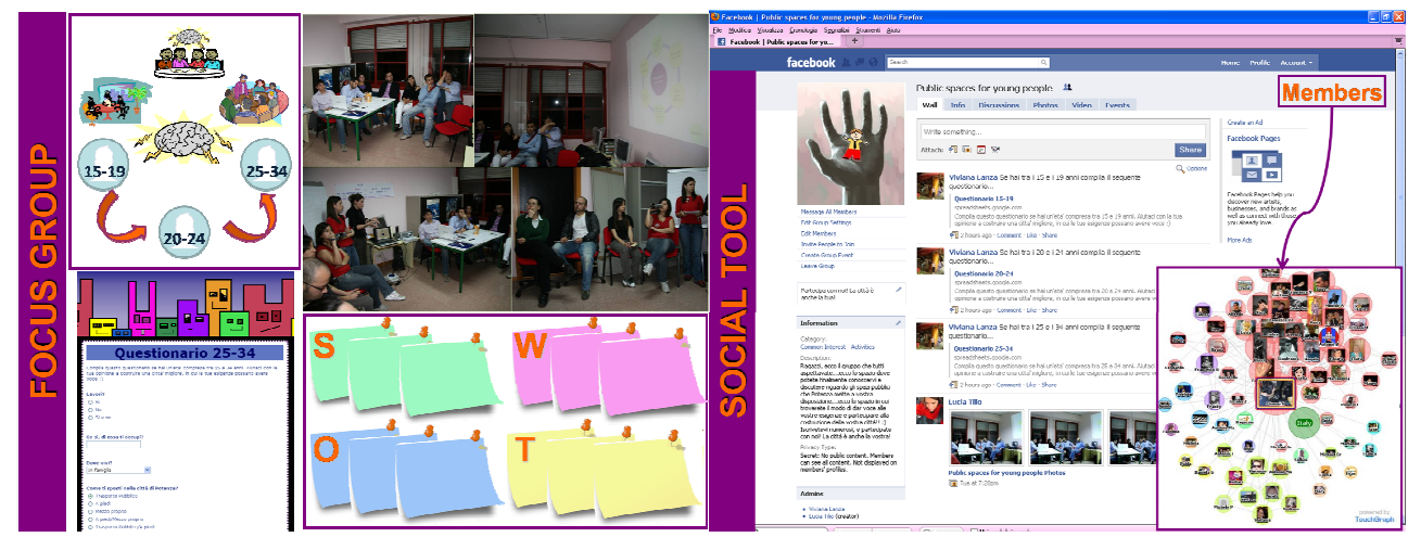
Fig. 2: Activities for light interaction forms: focus grouop meetings, web-survey, Facebook group

Through the Facebook group, members have been invited to answer to an on-line survey, powered by Google-docs. Survey'aim was to better define the detected problem, considering the opinions of young people, divided into three different groups, in relation to their age. Concerning their needs, their customs and their capacity to express opinions, young people, considered from 15 to 35 years old, has been divided into three groups: 15-19 years old, 20-24 years old, 25-35 years old. Survey answers, presented during focus group meetings, helped into context analysis, in particular they have been the basis for the SWOT analysis.