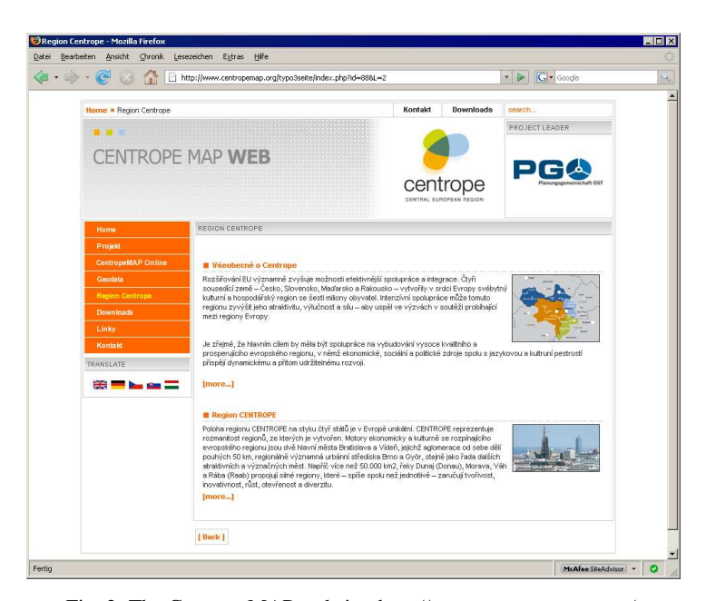
Fig. 2: The CentropeMAP website: http://www.centropemap.org/.

In 2007, the first few thematic maps were embedded into CentropeMAP. It was only a trial how the combination of the software used and SLD technology (see chapter 4.4 also) would work together. Only a few adjustments had to be made to the Mapbender software to bring SLD layers to life, but in this release it was very hard to apply changes to the statistical data from the back-end side. So this method could not be pursued further. It is still available for the public until the new version is published but no longer kept up to date.