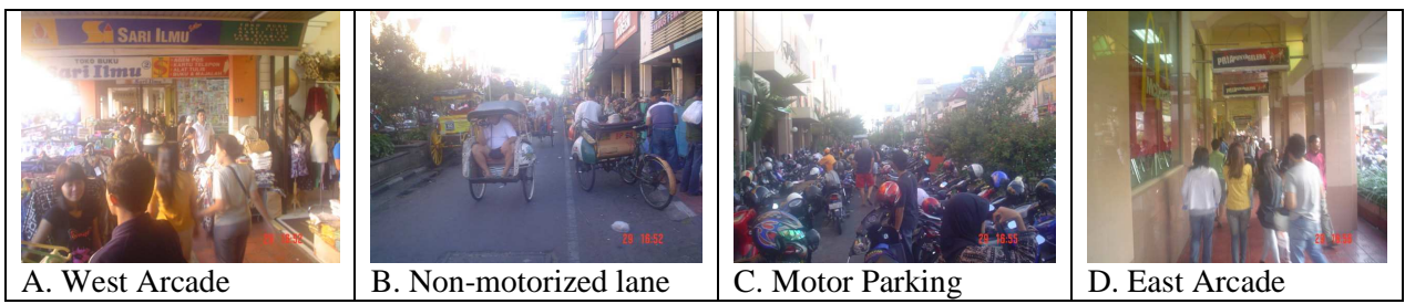
Figure 2. Some views of the landscape of Malioboro Street based on the Figure 1

Based on the data in Table 4, the existence of street trading on the Malioboro Shopping Arcade support the aspect the place for people delivered by the English Partnership (2005), where Figure 2 shows many people are on the arcade interact with the vendors. This is also supported by the number of motorcycle parking on