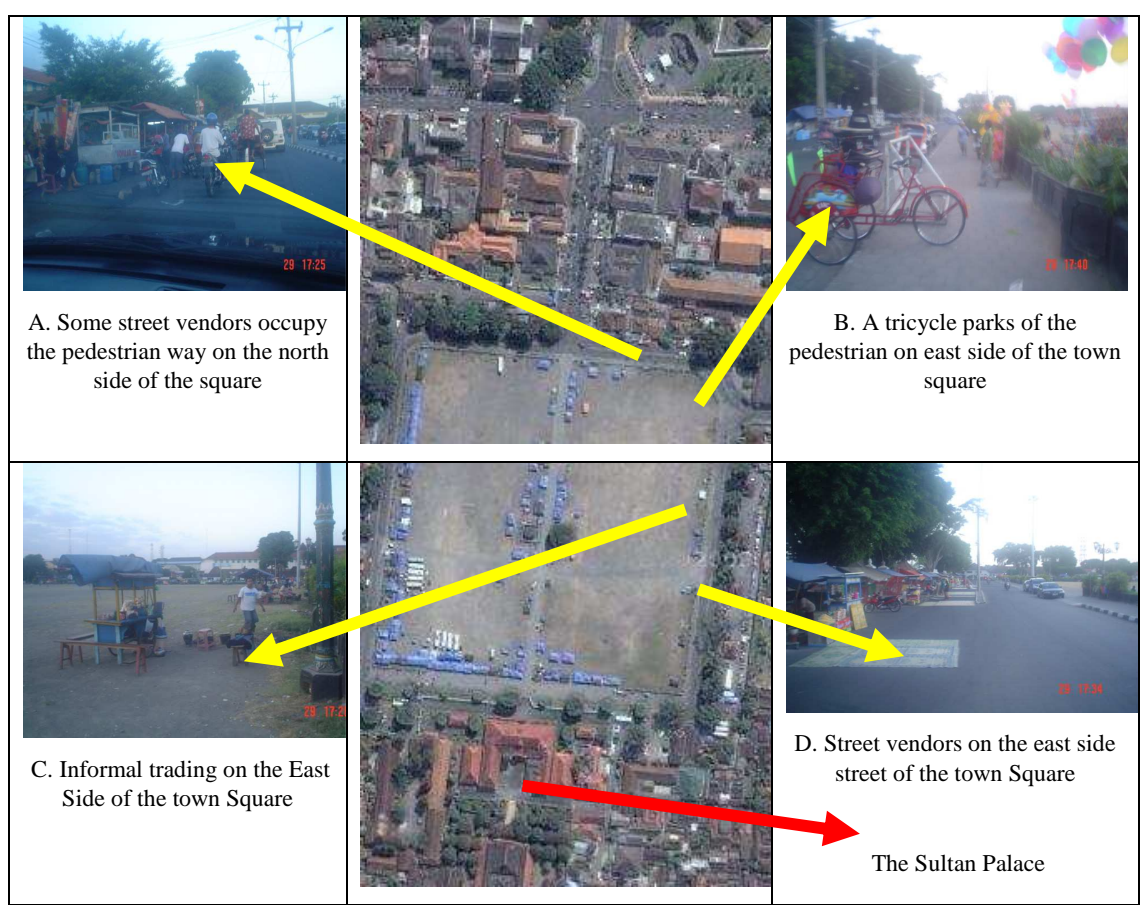
Figure 3: ogjakarta Town Square with some informal trading (street vendors)

Sekaten by using the square for trading, exhibition, and recreation. This activity significantly does not encourage the fundamental aspect of working with the landscape (English Partnership, 2005).