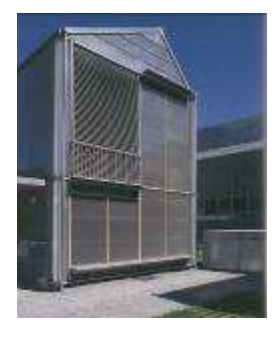
Fig.1: Solar House I

Solar House III, Glassx AG, Dietrich Schwarz, Ebnet-Kappel, Switzerland, (Fig.2.)