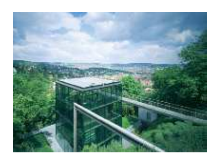
Fig.3: R128 in Stuttgart