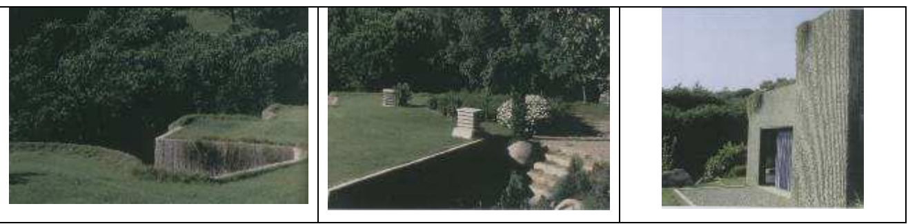
Fig.5: Riera House