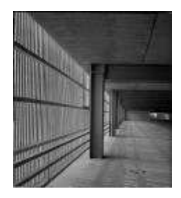
Fig.9: Parkhaus am Bollwerksturm

Passivhaus-community-centre, Hermann Kaufmann, (Fig.10.)