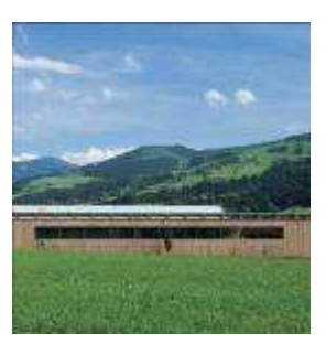
Fig.2: Solar House III

R128 in Stuttgart, Werner Sobek Ingenieure, Stuttgart, Germany (Fig.3.)