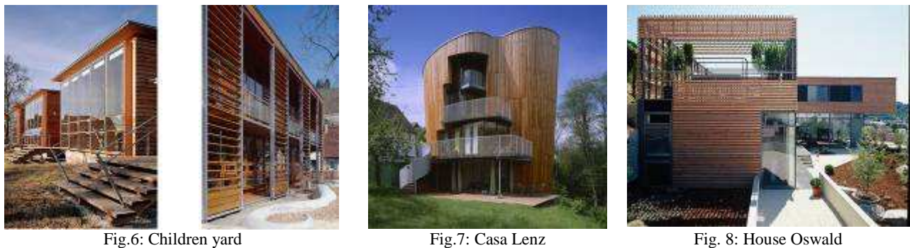
Fig. 8: House Oswald

A few buildings we have chosen to highlight are the buildings located around Lake Constance, examples of the environmental building movement which generated a number of impressive and innovative projects. Also, building by the architects D'Inka + Scheible (Fig.6. – Children yard), Kauffmann Theilig (Fig.7. – Casa Lenz) and Schaudt Architekten (Fig.8. - House Oswald), all provide examples.