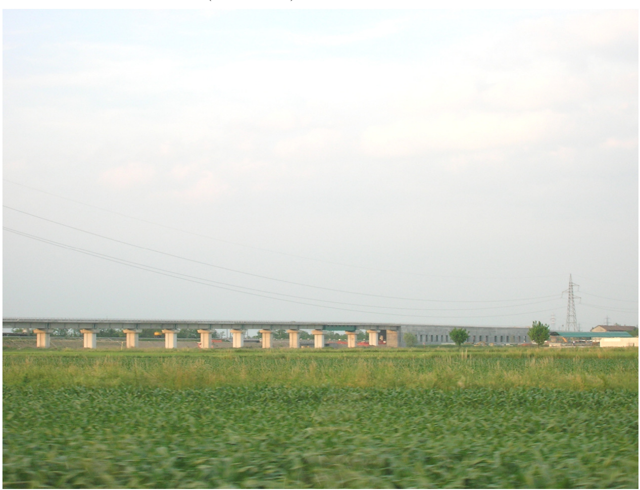
Fig. 1: Work for Milano-Venezia High Speed railway.

The works for High Speed lines, pillars of variable height from three to eight metres above ground level, raised tracks, tunnels flyovers and concrete strips, anticipate the perspective of not usual crossings, in which the landscape assumes a different vision from the perceivable one covering traditional railway. It's necessary, so, to return to being an integral part of landscape, with the specificity to assume at times the characters of an interior with views, who covers it (for traveller), and to reconfigure whole parts of territory, for whom observes it from outside (for inhabitant).