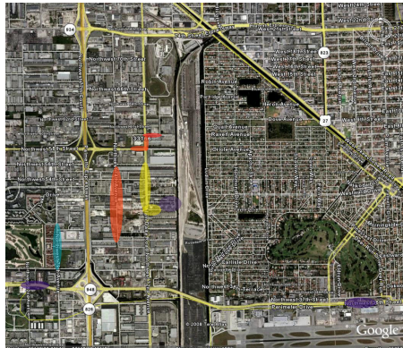
Figure 2: Clustered Concentrations of Similar Types of Firms