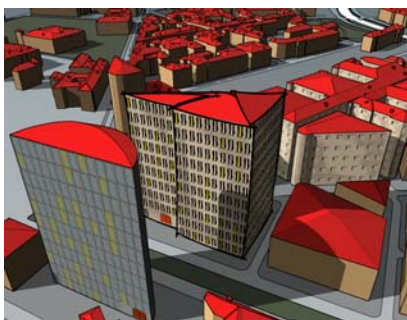
Fig. 5: Example of illustrative visualization for virtual 3D city models. Stylized and sketched buildings and facades provide a comprehensive, abstracted view to contents of 3D city models.