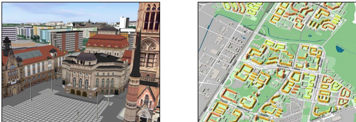
Fig. 1: Different design requirements on 3D city model visualization: Photorealistic visualization to give an intuitive impression of existing or planned environments (left) and abstract visualization to encode thematic information (right).

On the other hand, in applications that attempt to provide analytical and exploratory functionality, visual details of buildings are not of primary interest. Instead, the 3D representation of a city model serves as a medium to convey spatial-related thematic information in a comprehensive way. In the context of urban planning, e.g., thematic building information such as vacancy, ownership, or year of construction have to be considered. As an example, the illustration (Fig. 1 right) created by the Senate Department of Urban Development, Berlin, shows a 3D overview of the ownership structure of an urban area. While in 2D GIS applications exploration and analysis of thematic spatial-related objects and associated thematic information is a common practice, the potential of virtual 3D city models as a medium to communicate complex urban information spaces has not been explored extensively.