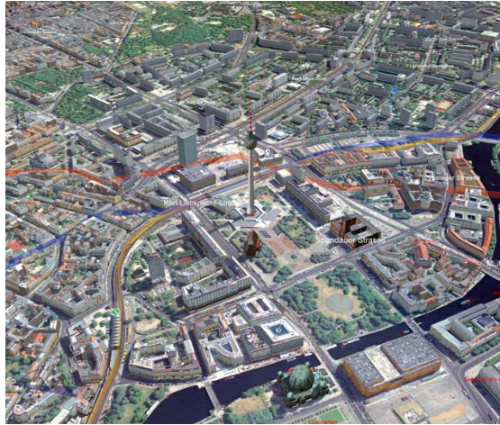
Fig. 3: Example of a photorealistic representation of virtual 3D city models. The Berlin 3D model contains true-ortho photography and LOD-3 and LOD-4 building models. The colored lines show part of the underground network.

To extend the scope of photorealistic rendering, the LandXplorer system also provides a specialized rendering engine for 3D vegetation, the LandXplorer Lenné3D module, which also includes a library of 3D plant models. Plant and vegetation modeling represents a challenging task, particularly because botanical knowledge is required and manual processes are involved, for example, to collect images of plant parts, to scan leaf textures, to produce variants of a single plant, and to set up properties for a plant type. To achieve interactive frame rates, we have to solve a non-trivial problem: reduction of the massive geometric complexity. The complexity results from two facts: 1) A single plant model, e.g., a typical tree, commonly contains between 50,000 and 150,000 textured triangles, whereby large parts are spent for tree leaves. 2) The human experience in seeing and realizing plants is highly developed.