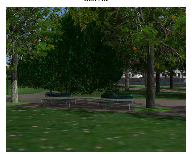
Image 12: Platzspitz park - Spatial arrangements: background enclosure