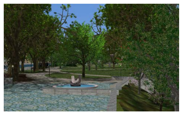
Image 4: Visualization of urban park - spring - in detail Carpinus B.